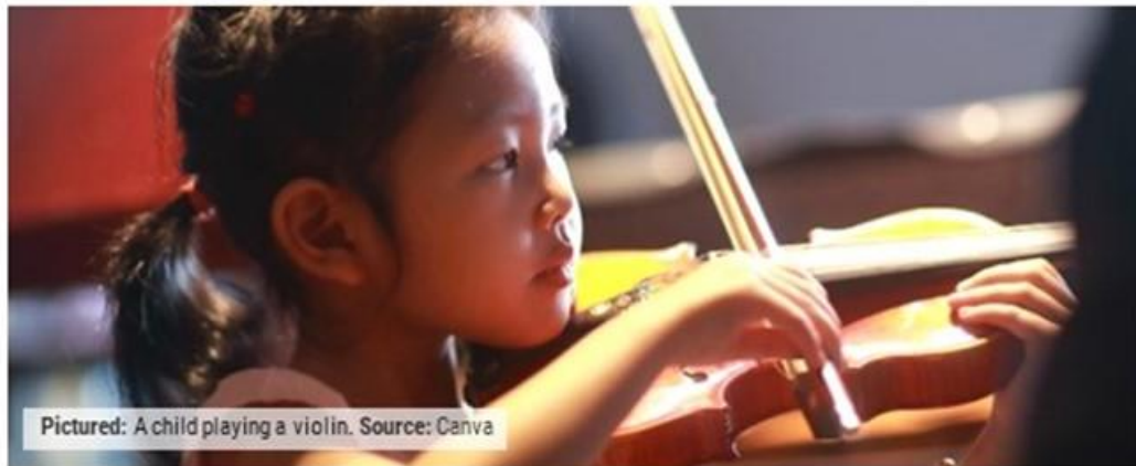
Pictured: A child playing a violin.

The Acoustical Society of America is 3D-printing violins to make the instrument more affordable for hundreds of children and adults who want to learn how to play. The 3D-printed violins are created in two sections, with the violin's body being made from a plastic polymer material. The neck and fingerboard are printed in smooth ABS plastic, which clips on to the body and gives a comfortable grip for musicians. The violins are much cheaper than a traditional violin, which can cost over £600. The 3D-printed violin cost only