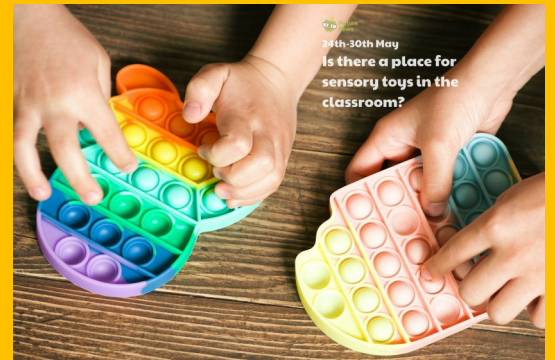
24th-30th May Is there a place for sensory toys in the classroom?