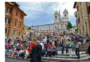
The Spanish Steps