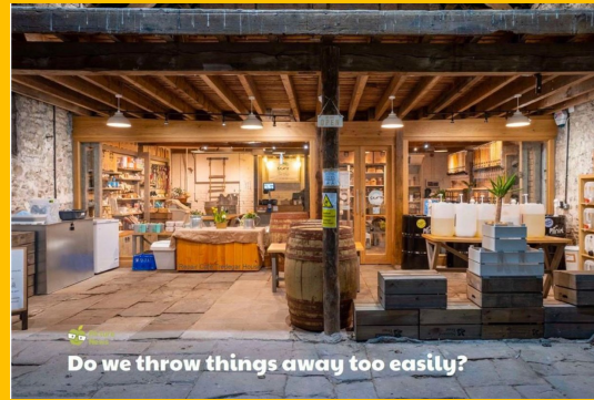
Do we throw things away too easily?