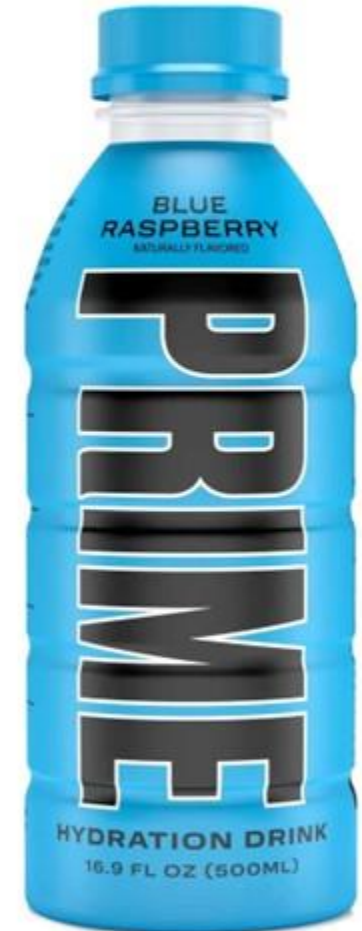
Pictured above: Prime Hydration Blue Raspberry flavour.

Prime Hydration comes in many flavours, including Blue Raspberry, Lemon and Lime and Ice Pop.