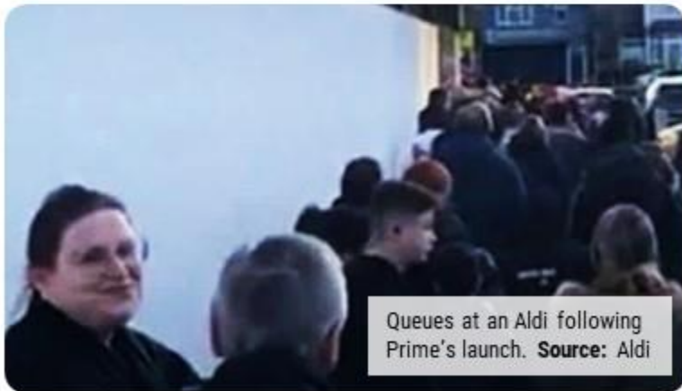
Queues at an Aldi following Prime's launch.