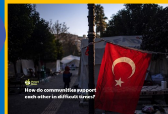
How do communities support each other in difficult times?