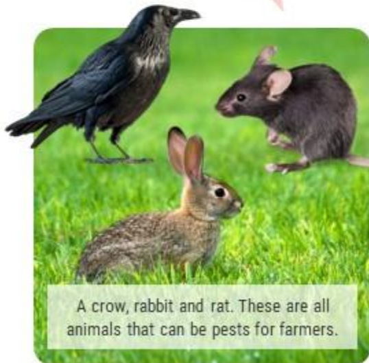
A crow, rabbit and rat. These are all animals that can be pests for farmers.

I had an ant infestation in my home. They had found a way into my kitchen and seemed to like the crumbs they found there.