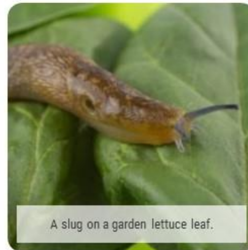
A slug on a garden lettuce leaf.

My dog had a tick attached to his ear. It is actually a parasite and can cause harm so it needed to be removed.