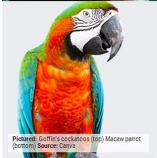
Pictured: Goffin's cockatoos (top) Macaw parrot (bottom)

Do you think it is a good idea for animals to make video calls?