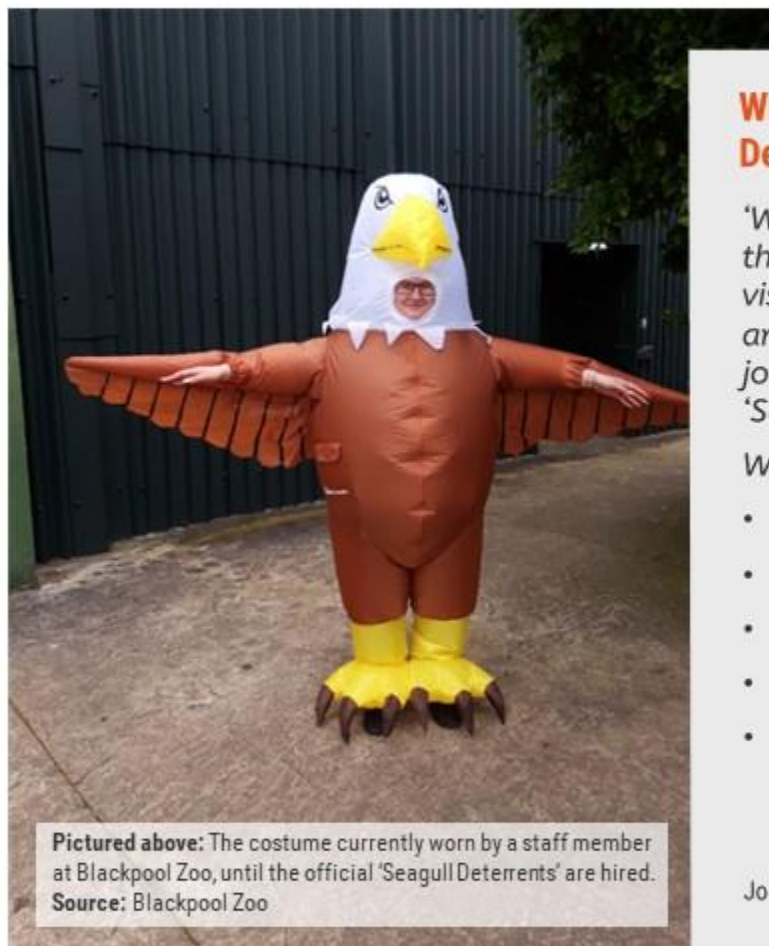
Pictured above: The costume currently worn by a staff member at Blackpool Zoo, until the official 'Seagull Deterrents' are hired.