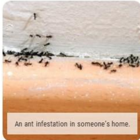
An ant infestation in someone's home.

Slugs cause so much harm to the plants in my garden. They eat holes in them and seem to especially enjoy my lettuce!