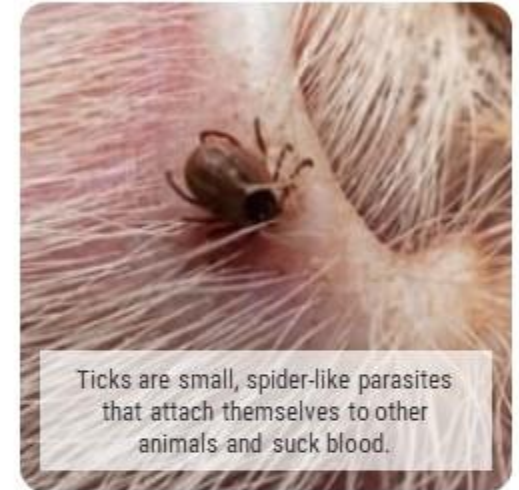
Ticks are small, spider-like parasites that attach themselves to other animals and suck blood.