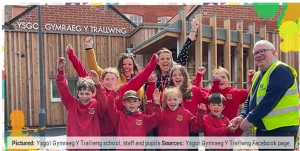
Pictured: Ysgol Gymraeg Y Trallwng school, staff and pupils