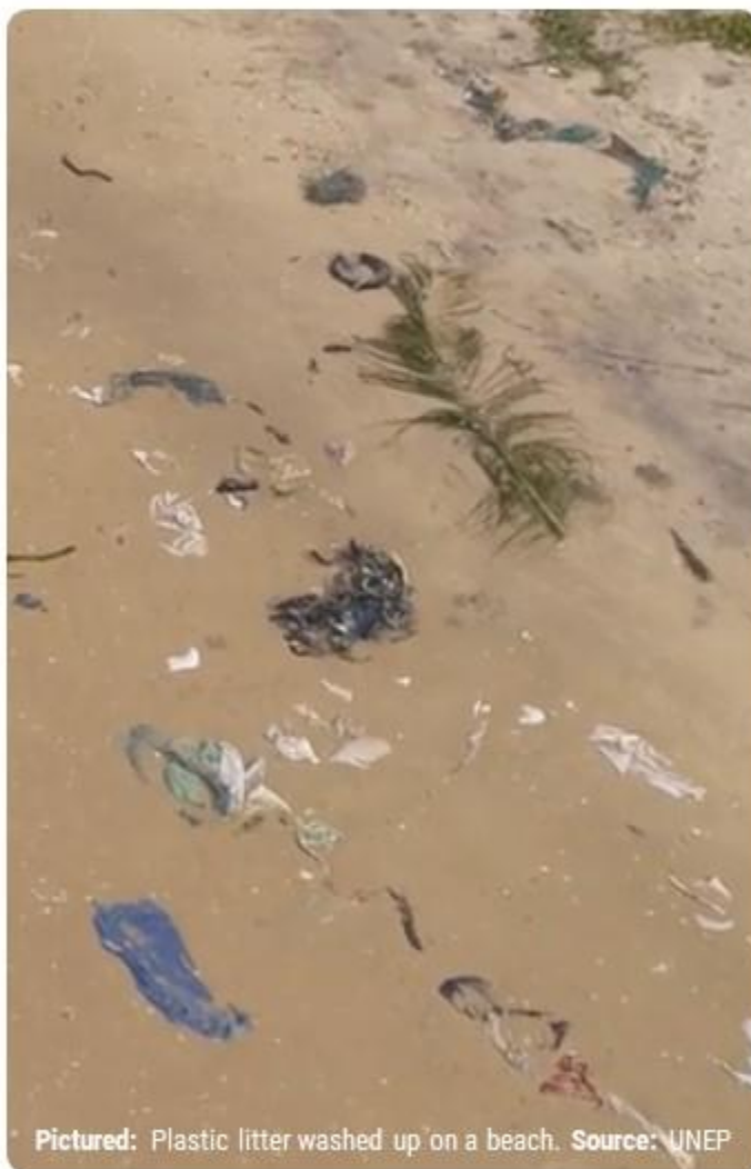
Pictured: Plastic litter washed up on a beach.

The use of appropriate alternative materials for single-use products such as wrappers and sachets (including switching to compostable materials that more easily break down), could reduce plastic pollution by 17% by 2040.