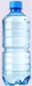
Plastic water bottle

Look at the resource below, which shares examples of items we might throw away.