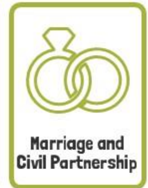
Marriage and Civil Partnership