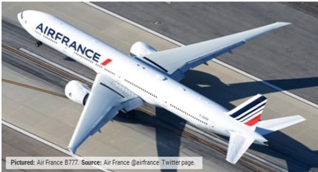
Pictured: Air France B777.

France has banned domestic short flights that would take less than two-and-a-half hours by train. The rules to ban short haul flights are to help lower carbon emissions and tackle climate change. For example, air travel between Paris and other cities like Nantes, Lyon and Bordeaux will now be barred. There are stipulations that must be met, in order for the flights to be outlawed. There must be regular trains able to meet the travel requirements of passengers, who would usually fly, with the capacity to take