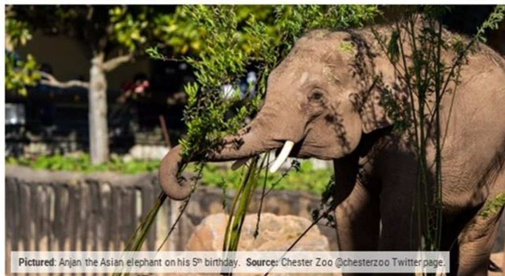
Pictured: Anjan the Asian elephant on his 5 th birthday.

A new study by Nottingham Trent University and Harper Adams University has been published in the journal, Animals , and concluded that elephants in zoos enjoy interacting with visitors. The animal behaviour experts from the universities examined more than 100 research papers to look into how visitors affected the behaviour of around 250 species in zoos. They observed that elephants enjoyed socialising more with each other and displayed fewer signs of boredom during public feeding times, when there were more people around. The world's largest land animal wasn't the only species that enjoyed human company. Animals also showing they enjoyed having visitors were penguins, jaguars, grizzly bears,