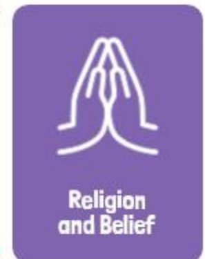
Religion and Belief