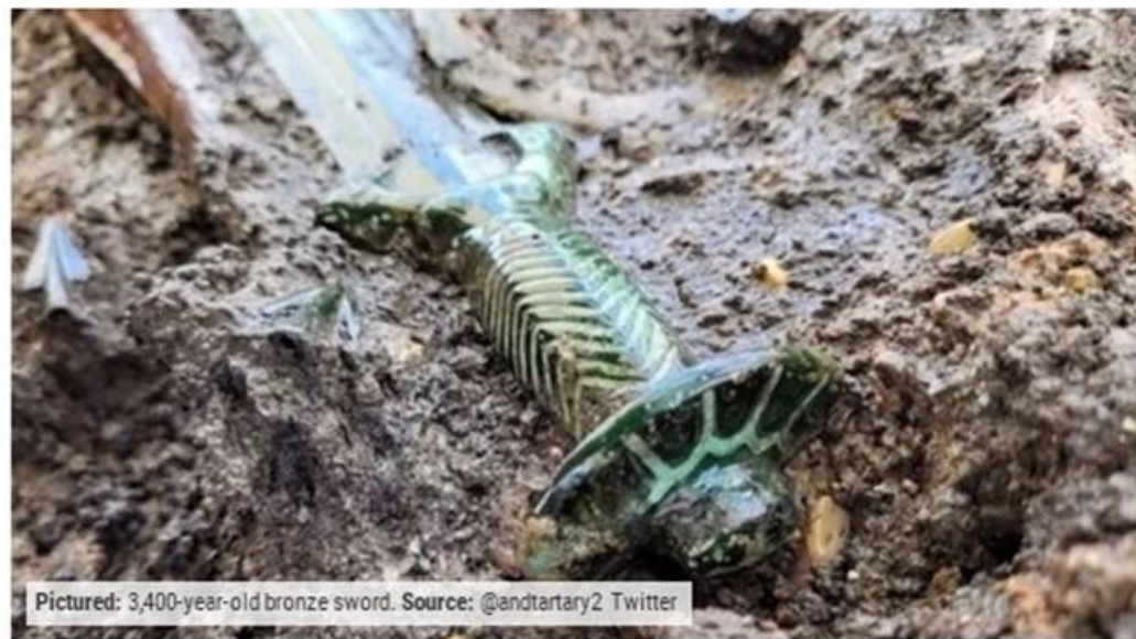
Pictured: 3,400-year-old bronze sword.