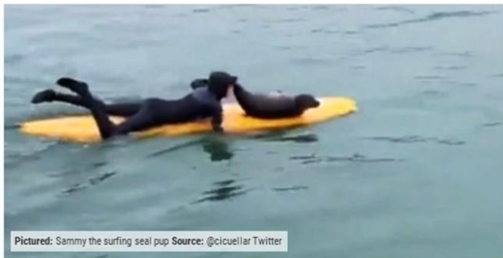
Pictured: Sammy the surfing seal pup

Surfers in San Diego received a surprise when they were joined by a seal pup! Typically, seals steer clear of humans, but not this baby seal! It was abnormally friendly and appeared unafraid as it proceeded to move from surfboard to surfboard, catching the waves. SeaWorld was notified and sent an expert crew out to check on the animal. Releasing a statement, SeaWorld officials reported, 'There was no need to intervene as the pup