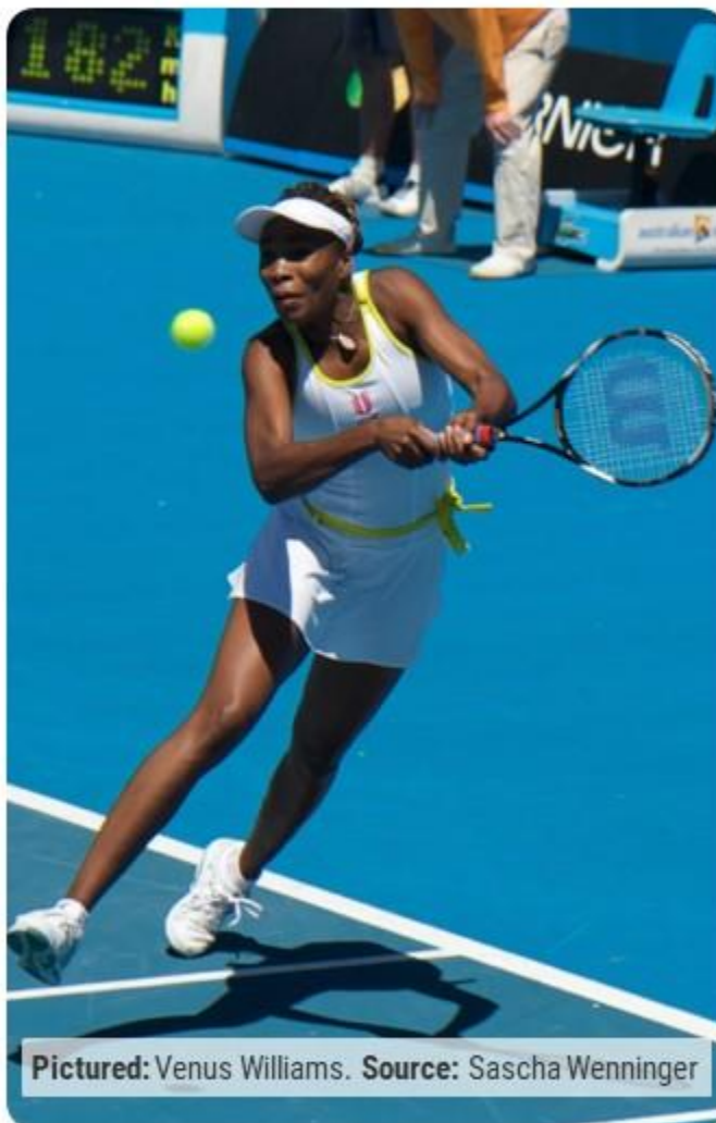
Pictured: Venus Williams.

I've learned you can always achieve more than you thought you could. There are moments when I've walked off the court, and I'm like, 'I don't know how I won that match.' It was actually impossible, but it happened, and then you realise that you can push yourself much further than you ever thought, and you can make the impossible happen.