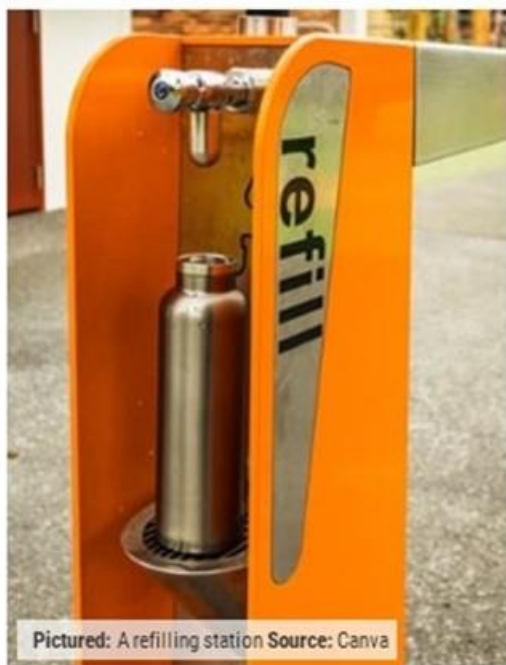
Pictured: A refilling station

Do you have a refillable water bottle? Do you know of any places where you can refill it?