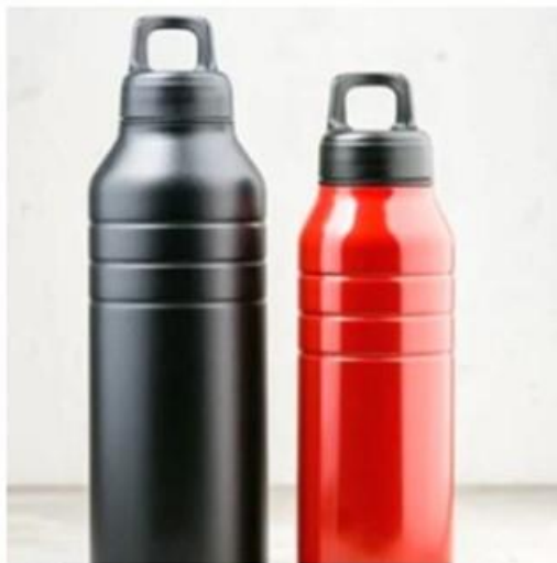
Pictured: Refillable water bottles.

The UK is embracing refillable water bottles and asking for a water top up has become a regular occurrence. According to a poll by Refill, an app that maps venues offering refills, around 60 per cent of people living in the UK now carry a reusable bottle. This is compared with just 20 per cent eight years ago. Steve Hynd, policy manager at City to Sea, a plastics pollution charity that runs the app, said, 'It always used to be that slightly awkward moment of asking to have your water bottle refilled – but now it's the norm.'