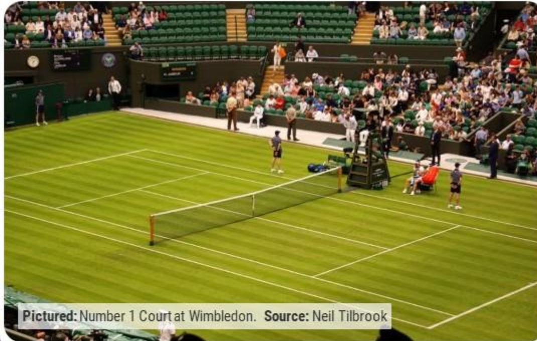
Pictured: Number 1 Court at Wimbledon.

Wimbledon has 18 Championships grass courts, 20 grass practice courts and 8 American Clay courts. It is the only Grand Slam tennis event still played on a grass court.