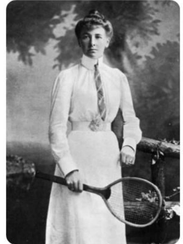
Pictured above: Charlotte Cooper Sterry, an English female tennis player, who won five singles titles at Wimbledon, and in 1900, became Olympic champion.

In 2019, 500,397 attended Wimbledon to spectate.