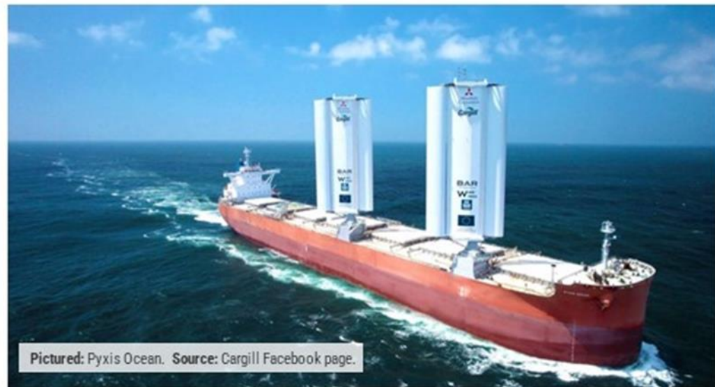
Pictured: Pyxis Ocean.