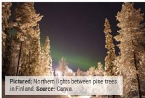
Pictured: Northern lights between pine trees in Finland.

Do you think this is a good way to work out how happy nations are?