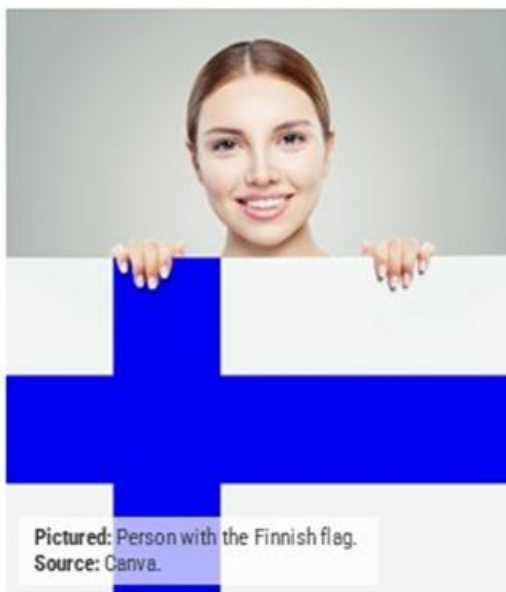
Pictured: Person with the Finnish flag.