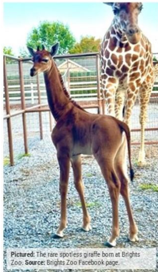
Pictured: The rare spotless giraffe born at Brights Zoo.

The names (and definitions) that people could choose from were, Kipekee (unique), Firyali (unusual or extraordinary), Shakiri (she is most beautiful) and Jamella (one of great beauty).