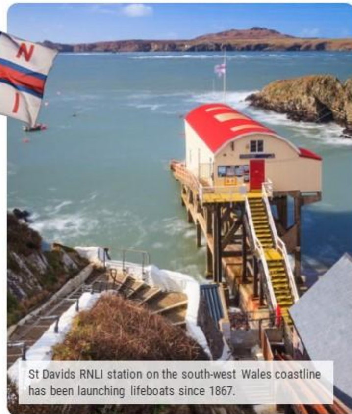
St Davids RNLI station on the south-west Wales coastline has been launching lifeboats since 1867.