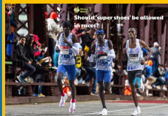
Should 'super shoes' be allowed in races?