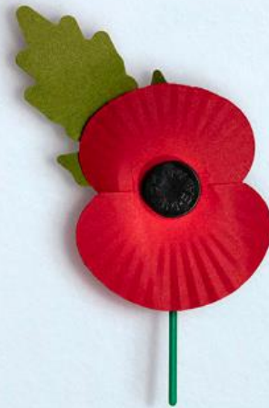
1980s Paper & Plastic