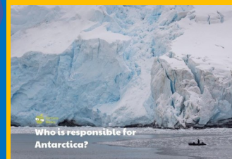
Who is responsible for Antarctica?