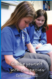
Clothe yourself with compassion Galatians 3:22

We looked at the picture below and then a few scenarios. Children came up with some great ways of showing compassion at school. We looked at the following picture to generate some ideas.