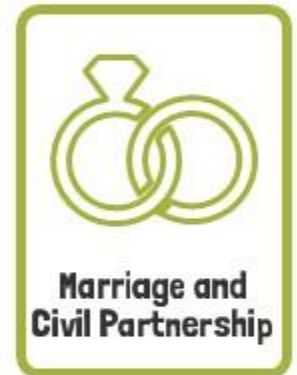
Marriage and Civil Partnership