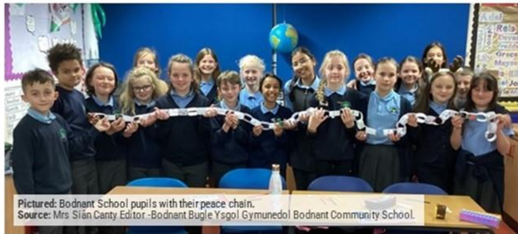
Pictured: Bodnant School pupils with their peace chain.

This month, we have launched our Picture News 'Let's Spread Peace' campaign. The campaign aims to spread peace by asking you to make your very own peace chain, with each link in the chain representing an action you feel will help to spread peace far and wide! In the past few weeks, you have amazed us by sending in photos of your fantastic creations! We believe that small acts of kindness help us spread peace in our communities and homes and can make a real difference. So, we have absolutely loved seeing what you have been making so far and hope to see more.