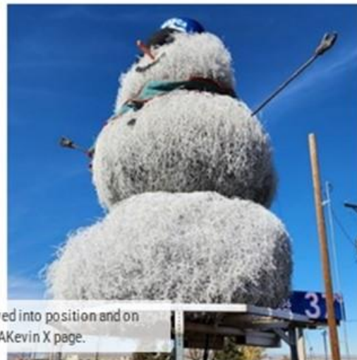
Pictured: The AMAFCA Tumbleweed Snowman being moved into position and on display beside the I-40.