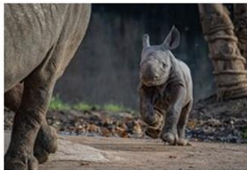
Pictured: Eastern black rhino Zuri and her new calf.

Do you know any facts about rhinos? Have you ever seen a rhino?