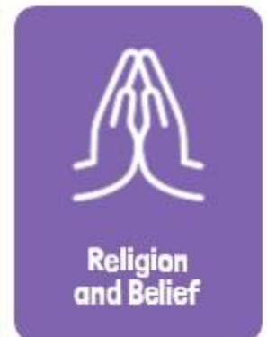
Religion and Belief