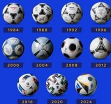
Pictured: 40 years of football ball history.

advice to the referee, will then use this information, along with limb-tracking, technology to determine whether a handball has occurred. A spokesperson for UEFA (the governing body responsible for the European Championships), said that the Connected Ball Technology will be used for the first time in the tournament's history. 'Combining player position data with artificial intelligence (AI), the innovation contributes to UEFA's semi-automated offside technology and will be key to supporting faster in-match decisions,' said UEFA. 'The technology can also help VAR officials identify every individual touch of the ball, further reducing time spent resolving handball and penalty incidents.'