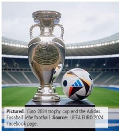
Pictured: Euro 2024 trophy cup and the Adidas Fussballliebe football.

It has been announced that the Adidas Fussballliebe, meaning 'love of football', will be the official match ball used at the men's Euro 2024. The ball will help referees give quicker offside and handball decisions. The 17 th edition of the European football tournament will take place in Germany, from 14 th June to 14 th July 2024. The special ball will use a rechargeable motion sensor at its centre that can send real-time data to video officials. This will be able to tell officials exactly when the ball was touched but not by which part of the player's body. Video assistant referees (VAR), who aid the referee by watching video footage of the match and providing