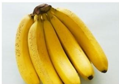
Picture: A person holding a banana (top right) and A bunch of bananas (above).

Can you share any more hints or tips that people can use to sleep better?