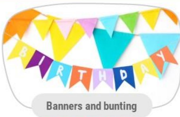
Banners and bunting