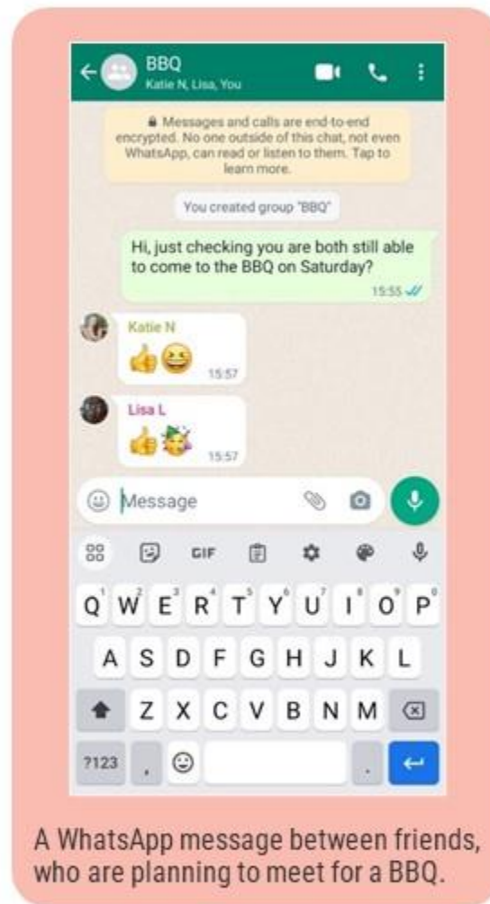
A WhatsApp message between friends, who are planning to meet for a BBQ.

What emojis have been used in the Picture News post and the WhatsApp message? Why have they been used?