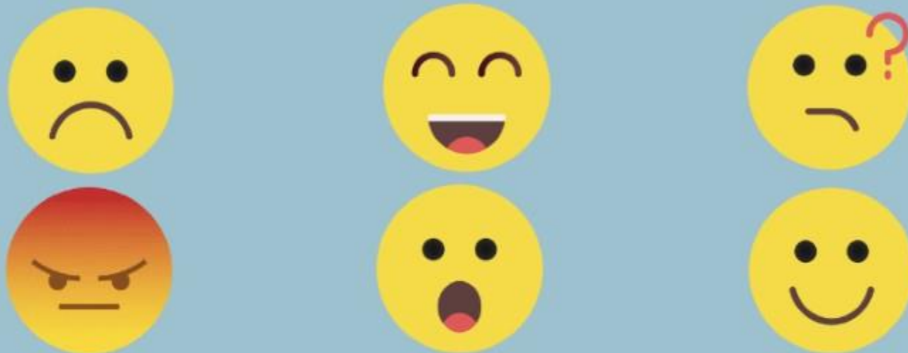
Smiley/emotion face emojis.

There are thousands of different emojis that people use for different reasons. Look at the examples below: