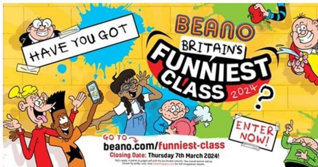
Pictured: How to apply to be named Beano Britain's funniest class.

Beano, the world's longest-running comic, has announced its search for Britain's funniest primary school class! The comic posted on X, 'Help Class 2B in their search for Britain's Funniest Class (and teacher)! 🤔 As much as The Bash Street Kids love a bit of hard work (ha!), a little help wouldn't hurt... 🙋 If you think your students have the gift of the gag, enter now.' The well-loved children's comic is celebrating the Bash Street Kids' 70 th anniversary with the launch of 'Britain's Funniest Class 2024' competition. Teachers can submit their classes' hilarious gags and jokes via the website before the closing date on 7 th March. The most side-splitting entries will then be put to a public vote, resulting in one comical class being named the