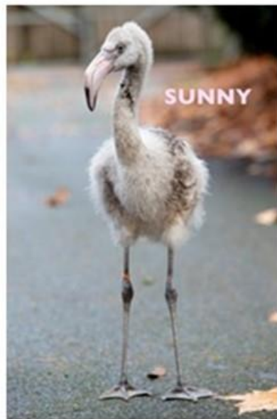
Pictured left: Flamingos. Pictured right: Sunny the flamingo chick.

Fast-thinking flight attendant, Amber May, received a unique request from one of the people on board the plane she was working on. The passenger, a zookeeper, had a very unusual problem and needed help building a nest! They were transporting rare flamingo eggs from Atlanta Zoo in Georgia, USA, to Woodland Park Zoo in Seattle, when their incubator broke. They asked the surprised flight attendant to help them keep the six eggs safe and warm. With hours of flight left to go, Amber came up with a plan – filling rubber gloves with warm water to keep the eggs at the correct temperature, which she refilled as the water inside cooled. Other travellers helped too, sharing their coats and scarves to keep the precious eggs insulated. The idea worked! All six eggs made it safely to