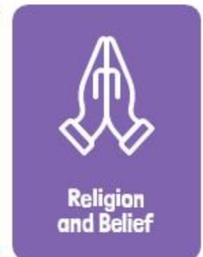
Religion and Belief