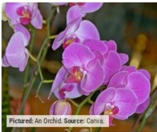
Pictured: An Orchid.