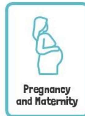
Pregnancy and Maternity