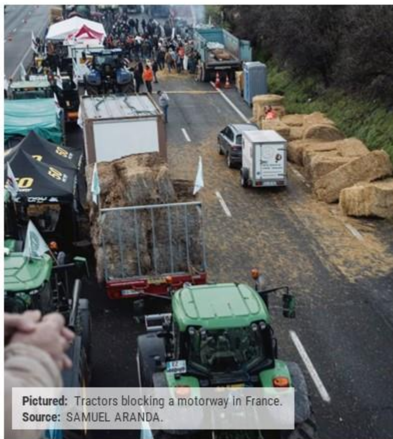
Pictured: Tractors blocking a motorway in France.