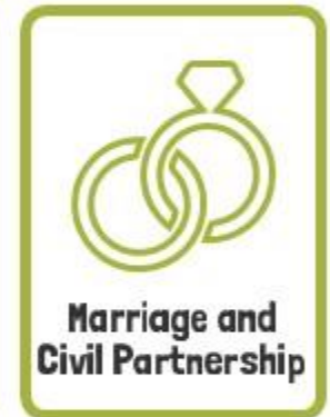
Marriage and Civil Partnership