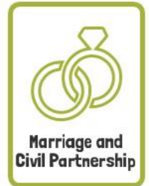
Marriage and Civil Partnership