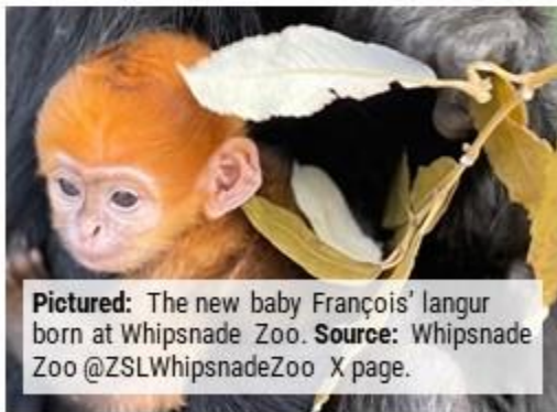
Pictured: The new baby François' langur born at Whipsnade Zoo.

Do you know any facts about François' langurs? Were you surprised to learn that they are born with bright orange fur that turns black?