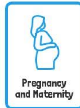
Pregnancy and Maternity