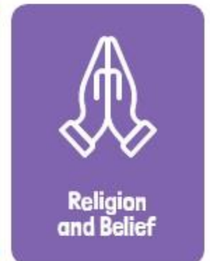
Religion and Belief