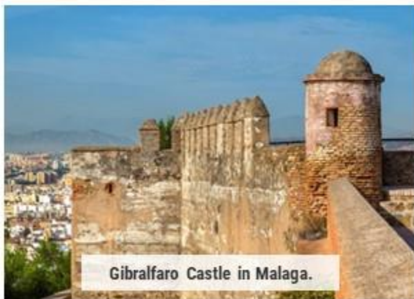
Gibralfaro Castle in Malaga.