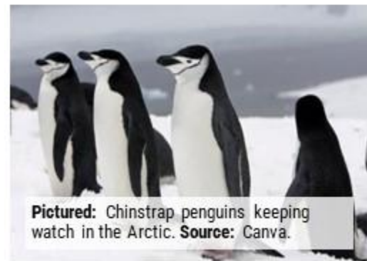
Pictured: Chinstrap penguins keeping watch in the Arctic.

Adult Chinstrap penguins love their naps. A recent study found that Chinstrap penguins can take as many as 10,000 naps a day! Each doze lasts for about four seconds, adding up to a total of 11 hours, but the penguins never fall into deep sleep. Scientists studying the penguins believe this may be an adaptation, which ensures the safety of the Chinstrap's