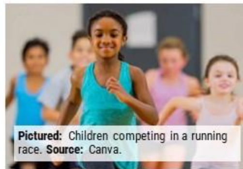
Pictured: Children competing in a running race.

Do you ever nap? How do you feel afterwards?