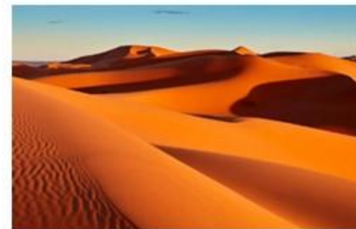
Pictured: Star dunes.

Sand dunes are large bodies of sand that are moulded and shaped by the wind. They can be found across the world and even on Mars! The largest sand dune on Earth is the Lala Lallia in Morocco, Africa. It is nearly as tall as Big Ben and is the width of about seven football pitches. Scientists believe this sand dune is about 13,000 years old. This particular sand dune is known as a star dune. This is because, as the fierce wind changes direction often, the dune forms different branching ridges, giving it the appearance of a star. While