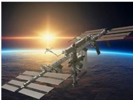
Pictured: International Space Station.