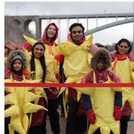
Pictured: People dressed as the Sun at Niagara Falls.

wearing red ponchos with yellow suns hanging over their chests. Do you enjoy getting dressed up for occasions? Do you think it helps to make them more special?