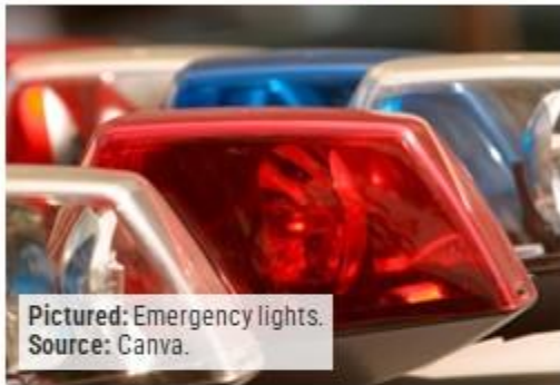
Pictured: Emergency lights.

A bird who lives outside a police station in Oxfordshire has learnt to mimic the sound of a police siren. Thames Valley Police, at a base in Bicester, released a video of the bird singing, and the copycat call sounds just like a police siren going off. Officers at the base admitted that they were initially confused and thought that their cars may have developed a fault! Further investigation revealed that the cars' sirens were in full working order. The bird was tracked down and its 'siren song' was recorded. Thames Valley Police posted about the incident on their social media platforms, 'Before you read on... this is 100% real and NOT a late April Fools joke! 🚫' Officers at our Roads Policing base in Bicester have been left a little confused this week, after finding out one of their resident birds has learnt to mimic the sound of a police siren! 🚓'