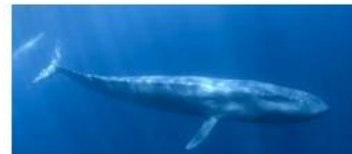
Pictured: Blue Whale.

Did you know that blue whales are the largest creatures on Earth? They can grow up to 30 metres in length! Do you know any facts about blue whales?