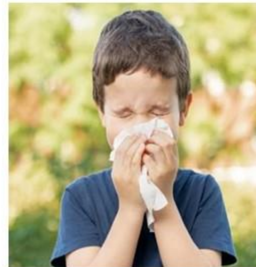
Pictured: Boy sneezing.

fever symptoms, namely itchy eyes, a runny nose and lots of sneezing! Some ways to help manage these symptoms include wearing sunglasses to limit pollen getting into your eyes, closing windows at night and changing clothes after you have been outside.