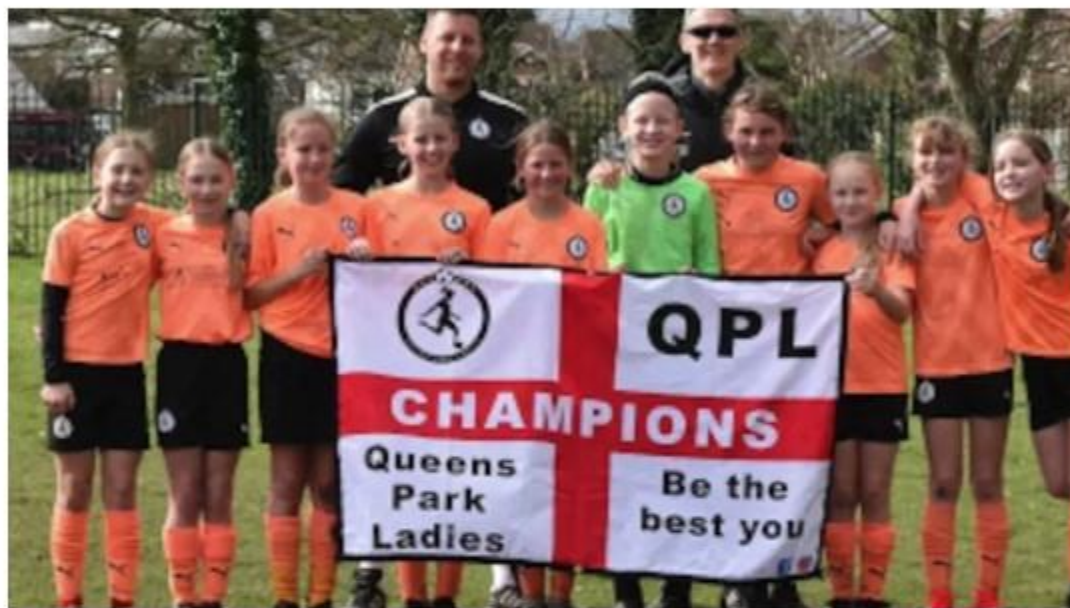
Picture: The girls holding a flag with the slogan, 'Be the best you'.

At first [the boys] underestimated us and they were sniggering and they didn't take us seriously - but then we showed them if they can do it, so can we... It's just amazing that we got to do it together and as a team and we could show them that we're more than they expected.