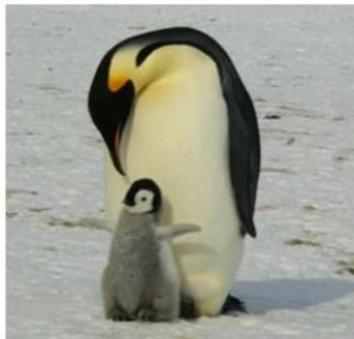
Pictured: Emperor penguin with its chick.

Wildlife photographer, Bertie Gregory, couldn't believe his eyes when he witnessed baby penguins making a giant leap from the top of an ice shelf into the ocean. The photographer expressed concern for the penguins as the jump was an enormous 15m drop, and the icy Antarctic sea below was full of floating chunks of ice. But he says, 'To my amazement, they were not just surviving but popping up and going, 'I can swim!' This is their first swim ever, the first swim of their lives.' Before Gregory captured his incredible images, researchers had been unsure