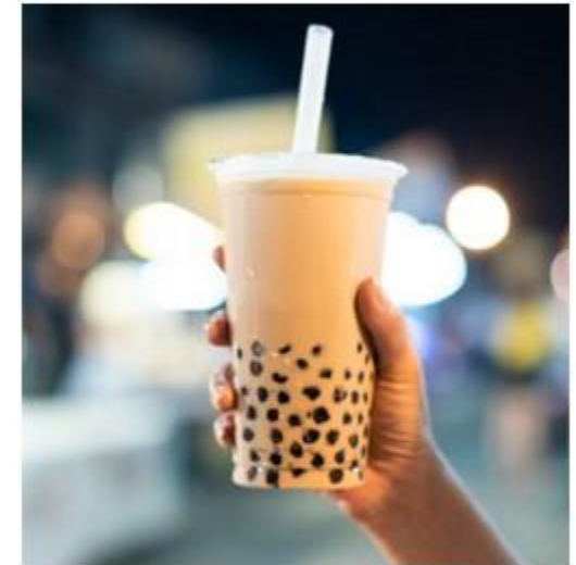
Pictured: Pearl milk tea.

media. As the super-cool beverage has travelled around the world, different variations of the drink have evolved, including the use of syrups, jellies and new flavours, such as matcha, jasmine, mango, passionfruit and so many more! The drink even has its own emoji! 🧋