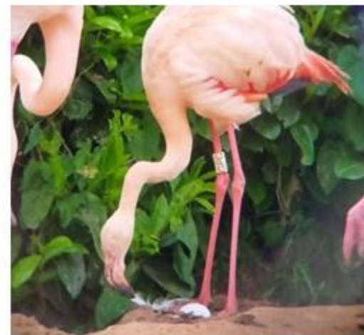
Pictured: Gertrude and her egg.