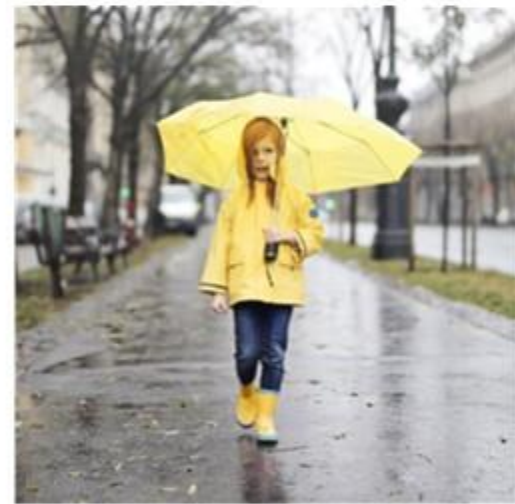
Pictured: Walking in the rain.

While the UK is no stranger to wet weather, some forecasters are predicting a seriously soggy summer which could see fifty days of rain. That is ten more days of rain than the country had last summer. In order for a day to be classed as 'rainy,' there must be a minimum of 2.5mm of rainfall within 24