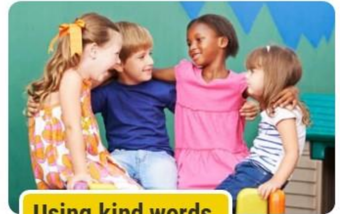
Using kind words.