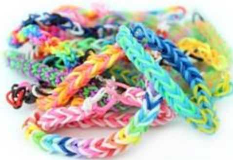
Loom band bracelets.