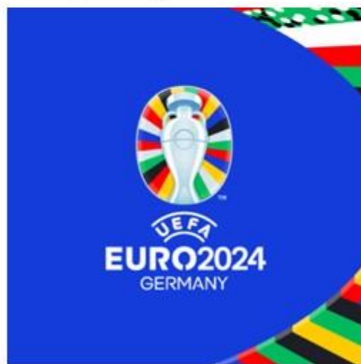
Pictured: Euros 24 logo.

win points. This is the group stage. The top two, or in some cases three, teams in each group will go on to the knockout stage – where only the winner of each match will go on to the next round. The final of the Euros is due to be played in Berlin on 14 th July. Who will you be supporting?