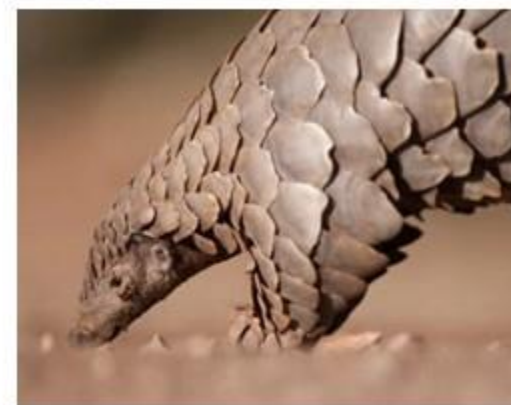
Pictured: Giant pangolin searching for termites.

What animal can curl into a ball and is covered in scales? It's a pangolin! An incredibly rare type of pangolin has been spotted in Senegal, Africa, for the first time in 23 years. The giant pangolin is endangered, which means there are not many of them left. One of the main reasons for this is poaching. Their meat is considered a delicacy in many parts of Asia and Africa and their scales are sought after, so the animals are hunted and trafficked. These adorable animals are easily caught, as their response to danger is to simply curl up and wait, which means they can just be picked