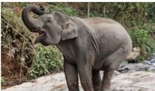
Pictured: Asian Elephant Trumpeting.