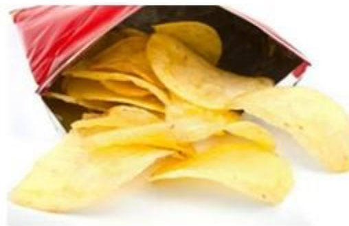
Pictured: Ready salted crisps.

tree flavour? Market competition is fierce, and crisp companies are constantly working to come up with new concepts and flavours to tempt customers. Picture News' very own consultant, Chloe, says, 'Have you even lived if you haven't tried Pickled Onion Monster Munch?!' Which leads us to ask - what's your favourite flavour?