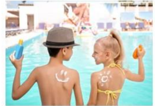
Pictured: Applying sun cream.

The sun is an essential part of life on Earth, providing light, warmth and energy. Sunlight can be good for humans, as it helps the body to produce vitamin D that keeps our bones strong, and it boosts our mood! However, it can also be harmful to our skin. Did you know that our skin is an organ? In fact, it is the largest organ in the human body! It acts as a barrier to protect the inside of our bodies from the outside world, so it is important that we take care of our skin. In the summer months, we can use sun cream to help protect our