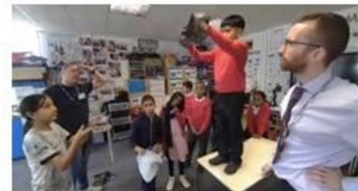
Pictured: Year 5 conducting an air resistance experiment.