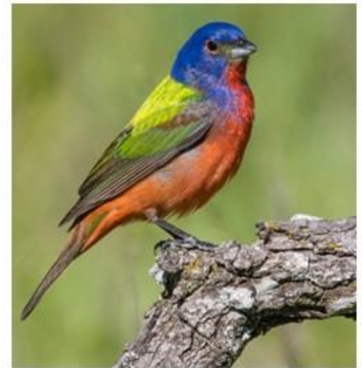
Pictured: A Painted Bunting bird can be seen at Sankofa Wetland Park and Nature Trail.

Community members in New Orleans have turned a vacant, rubbish-filled 40-acre area into a thriving wetland and haven for people and birds. Local residents are working together with the Sankofa Community Development Corporation (SCDC), which was set up by Rashida Ferdinand, to restore the wildlands she grew up exploring and playing in. The area that had suffered, due to decades of damage and neglect, has been restored to its previous natural glory and is now officially known as the Sankofa Wetland Park and Nature Trail. Wildlife has returned to the site, with the SCDC reporting that there are now over 100 species of songbirds, ducks, near-shore waders, egrets, herons, otters, beavers, and a variety of amphibians and reptiles. It is hoped that restoring the wetlands will also help to protect the residents and