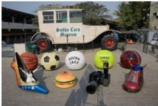
Pictured: Several of the custom cars at Sudha Cars Museum.

A very special car museum in Hyderabad, India, has been awarded the world record for the largest collection of wacky vehicles in a museum! Car designer, Sudhakar Kanyaboyina, is fulfilling his childhood dream of hand making fully-working custom cars, designed to look like everyday objects. The museum houses 57 individual vehicles, including a vintage computer, shoe, camera, stiletto, hamburger, handbag, chessboard, wedding dress, sofa, snooker table, cricket bat, many sports balls, and even a toilet! As you might expect, Sudhakar's desk at the museum is also a car!