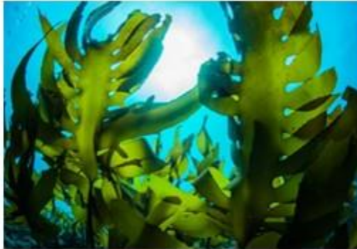
Pictured: Seaweed growing underwater.