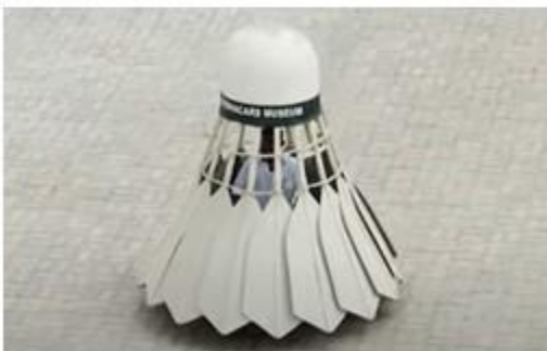
Pictured: The shuttlecock car.

If you were to create a custom car, what object would you choose to base it on?