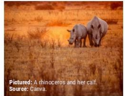
Pictured: A rhinoceros and her calf.

an extra pair of eyes that can keep track of animals and send us important information about where they are and what they need.' This smart robot is already helping conservationists learn more about how to protect endangered animals and keep them safe in the wild.