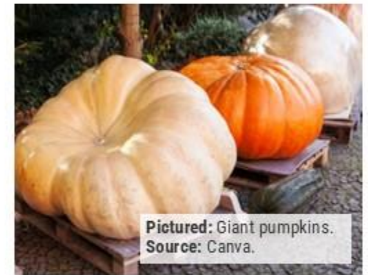
Pictured: Giant pumpkins.

Have you spotted any pumpkins? Were they giant?