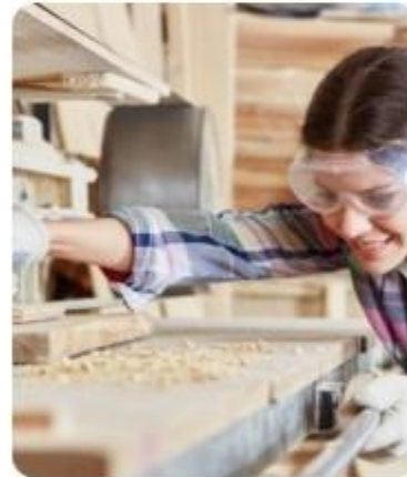
A joiner working flexitime.

I have a job share. We work really well together and because we have different strengths and skills, we both bring a great deal to our role. It also means I can spend time with my young children on the days I am not working.