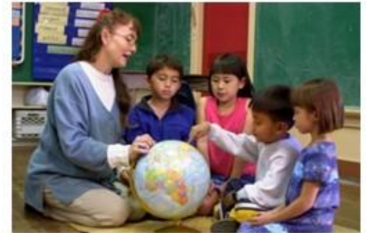
Pictured: Teacher and students with a globe.