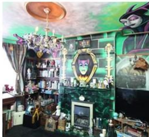
Pictured: The interior of the Disney themed house.

A uniquely decorated home has gone viral after it was put up for sale by its Disney superfan owner! The estate agents in charge of selling the home posted that their advertisement had gone global: 'Our property listing has captured the world's attention, and we couldn't be more thrilled! 🇬🇧' The Disney-themed home features huge murals of famous characters, such as Aladdin, Mary Poppins and Peter Pan. The property is in the Welsh seaside