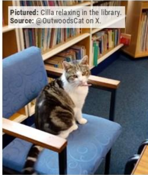
Pictured: Cilla relaxing in the library.