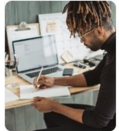
A graphic designer working from home.

Were you aware there are so many different types of flexible working? Do you think you would choose to work flexibly? Why?