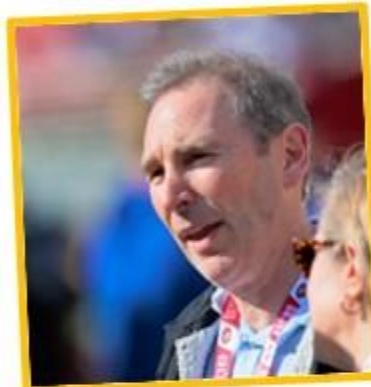
Pictured: Andy Jassy.