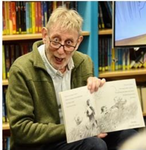
Pictured: Michael Rosen reading his famous story, We’re Going on a Bear Hunt.

Words. He’s excited to see young people enjoying stories and believes they’re writing more than ever, through social media and texting. ‘When I see children laugh and enjoy stories, it feels like magic,’ he added.