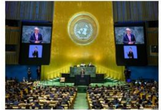
Pictured: Debating at UN Headquarters in New York, USA.

Leaders from around the world are meeting at the United Nations (UN) Headquarters in New York City, to talk about big problems facing the planet. The UN was created after World War II to help countries work together for peace, human rights, and helping people in need. Today, almost every country in the world is a member, and when issues or problems arise, the UN is one of the first places where countries share their concerns. This year, the UN will meet for the 79 th time! There are many important issues to discuss,