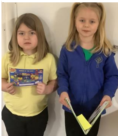
Y2 Award winners