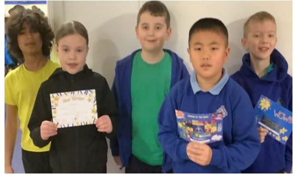
Y4 Award winners and special mentions