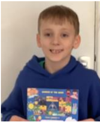
Y3 Award winner