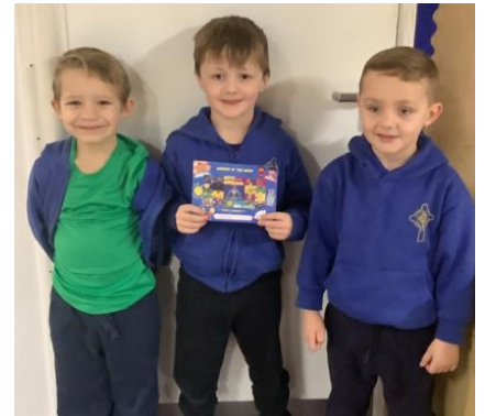
Y1 Award winners and special mentions