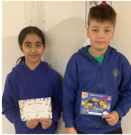
Y5 Award winners