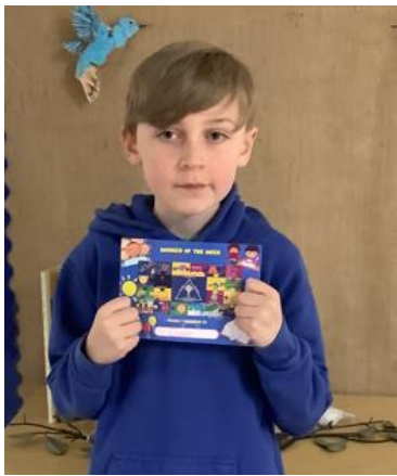
Y6 Award winner