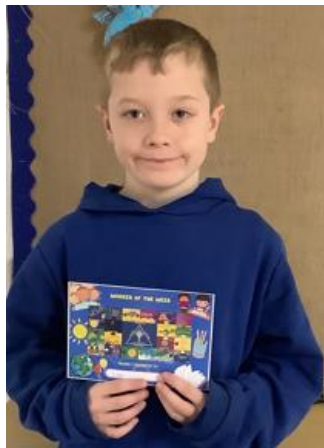
Y5 Award winner