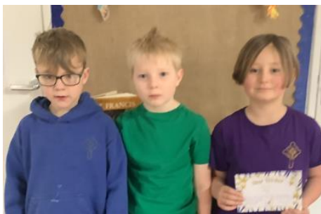
Y3 Award winners and special mentions