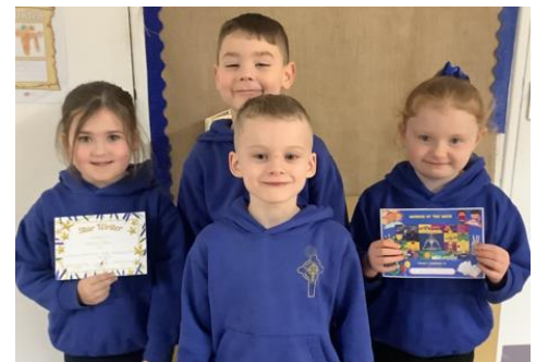
Y1 Award winners and special mentions