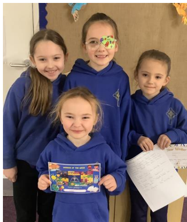
Y2 Award winners and special mentions