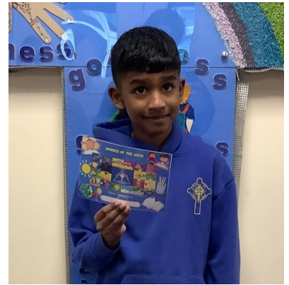
Y4 Award winner