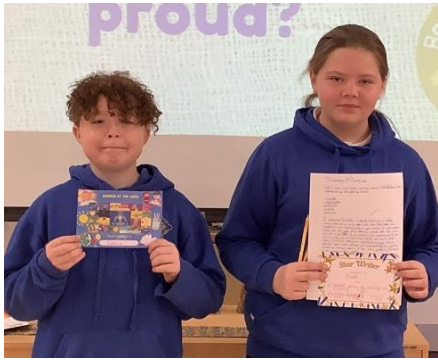
Y6 award winners