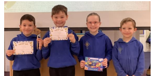
Y1 Award winners and special mentions