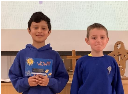
Y3 Award winners and special mention