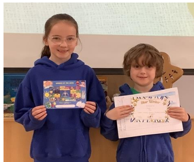
Y2 Award winners