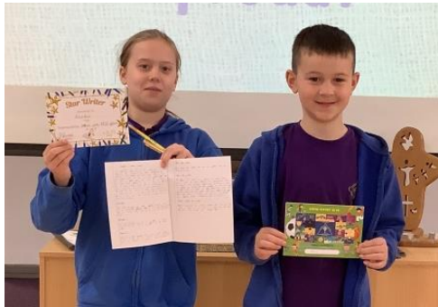
Y5 Award winners