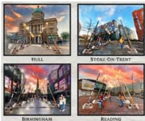
Pictured: The Wizarding World Wands will tour four UK locations as voted by the public in celebration of the release of Fantastic Beasts.

characters from the bestselling books including Harry Potter, Ron Weasley and Hermione Granger. They have come from The World of Harry Potter in Hertfordshire. The wands will light up every evening, for a show with music from the wizarding world, in celebration of the April release of the new film 'Fantastic Beasts: The Secrets of Dumbledore'. The tour starts on 2 nd March