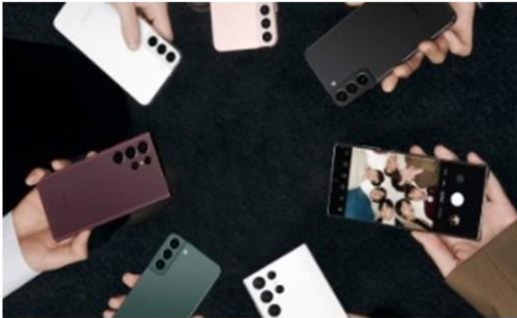
Pictured: Samsung Galaxy mobile phones.