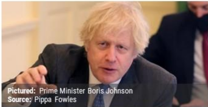
Pictured: Prime Minister Boris Johnson

Boris Johnson is under a lot of pressure and is facing anger from people, with some calling for him to stand down.