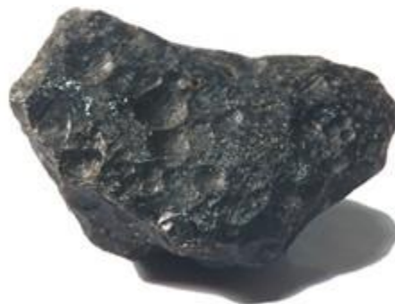
Pictured: A black meteorite

sold but no one bid on the Mars rock! A bean-sized fragment (weighing 1.7g) of the meteorite that fell in Winchcombe last year has sold at the auction for £9,256, that is more than 120 times the value of its weight in gold! Scientists say that the chunk of blackened rock is the most important space rock ever to be recovered in the UK. This is because the meteorite could provide clues as to how the planets in our Solar System, including Earth, were formed.