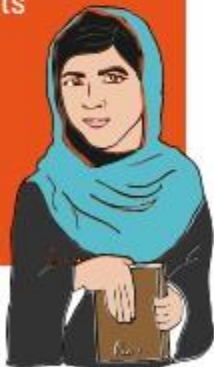
Malala Yousafzai, an activist for girls' education.