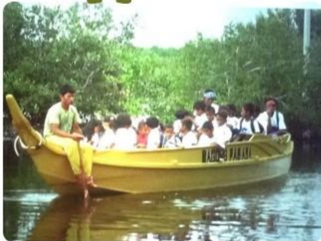
Pictured above: Children in the Philippines travelling to school.

Look at the resource below, where some children share some information about their school.