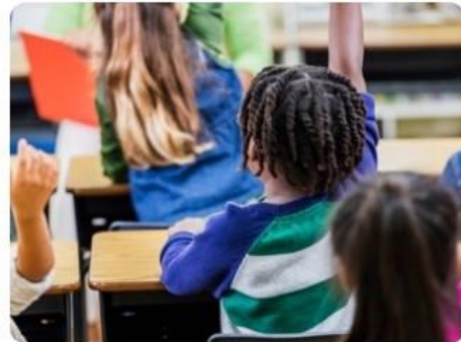
Pictured above: These children in the USA do not wear a uniform to school.

In Norway, we don't start school until we are 6 years old. School lasts for about 4 hours a day but it will get longer as I get older. I don't wear a school uniform and everyone brings their own lunch to school.