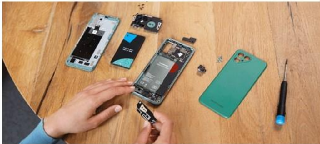
Pictured: The Fairphone 4.

we are proving that it is possible to do things differently." You can easily exchange, repair and customise the phones, as the display screen, battery, USB ports and cameras are all accessible and can be removed. "The Fairphone 2 could be taken apart in under two minutes. There were models where you didn't even need tools to take the display off in order to replace it yourself." says Urs Lesse, a volunteer who helps people fix their own phones in Aachen, Germany.