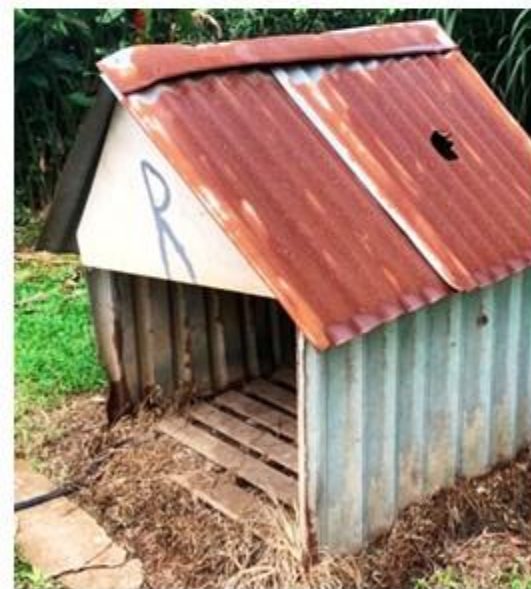
Pictured: Roky kennel, showing the damage

sold but no one bid on the Mars rock! A bean-sized fragment (weighing 1.7g) of the meteorite that fell in Winchcombe last year has sold at the auction for £9,256, that is more than 120 times the value of its weight in gold! Scientists say that the chunk of blackened rock is the most important space rock ever to be recovered in the UK. This is because the meteorite could provide clues as to how the planets in our Solar System, including Earth, were formed.