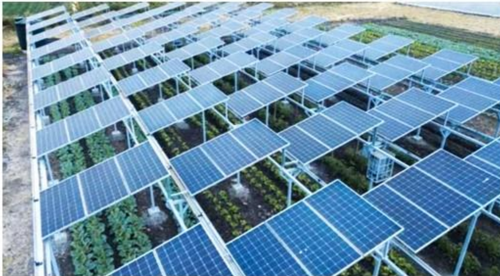
Pictured: Plants being grown in the trial beneath Agrivoltaics.

by the University of Sheffield, World Agroforestry, and the Kajiado-based Latia Agripreneurship Institute has shown optimistic results. They reported that cabbages grown under the 180, 345-watt solar panels are a third bigger than those grown in control plots with the same amount of fertiliser and water. The scientists also grew larger aubergines, lettuces and maize. The system is being used successfully in France, the US and Germany as well.