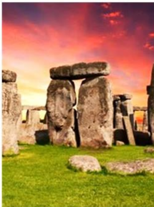
Pictured: Stonehenge.