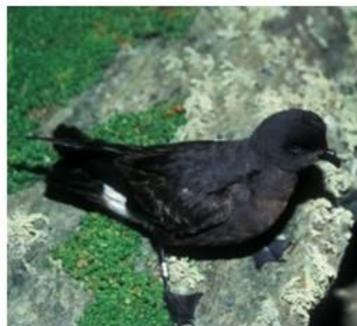
Pictured: Manx shearwaters