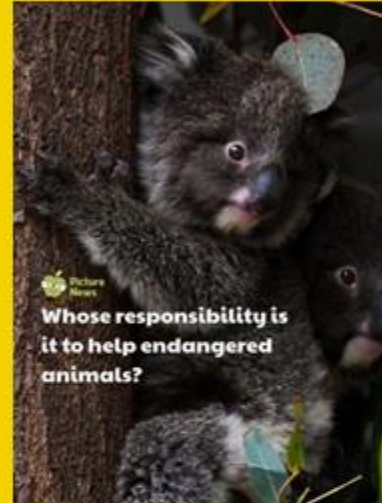
Whose responsibility is it to help endangered animals?

I think that its everyone's job to help endangered animals because we can all make the right [decisions] and make the world a better place.