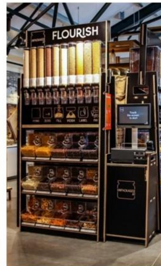
Pictured: An Unpackaged refill station at Flourish at Glenavon Farm, where you can stock up on rice, pulses, pasta, nuts, seeds, dried fruit, sweets, coffee beans and more.

UK supermarkets have joined forces to tackle single-use plastic packaging, by forming the Refill Coalition. Major supermarkets, including Morrisons, Marks & Spencer, Waitrose and Ocado along with supply chain solutions company CHEP, are aiming to provide refillable groceries to every UK shopper. They have all signed up to the Refill Coalition, which is planning to make package-free shopping mainstream and therefore reduce the 56.5 billion units of single-use plastic packaging sold every year in the UK. The Refill Coalition said that it would reimagine how the foods that lots of people buy, such as pasta and grains, and household products are supplied. They added, "We're delighted to be joining forces with the mutual objective of reducing single-use plastic packaging. The universal end-to-end solution being developed by The Refill Coalition presents a landmark opportunity for us to make a step change in the commercialisation of refills which we know can play a significant role in the reduction of single-use plastic packaging."