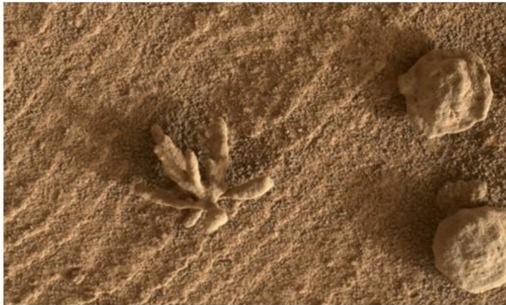
Pictured: The image of a flower-like rock captured by the Mars Rover.

Scientists say that this rock (sized smaller than a penny) and other discoveries that are being captured using the rover's Mars Hand Lens Imager (MAHLI) camera on the end of its robotic arm, are giving them a greater understanding of the history of the Red Planet. Curiosity, which was built by NASA's Jet Propulsion Laboratory in Southern California, is a car-sized rover designed to explore the Gale crater on Mars and record its findings.