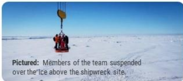
Pictured: Members of the team suspended over the ice above the shipwreck site.

Amazingly, all 27 men under Shackleton's command would survive the Antarctic expedition, but their sunken ship remained lost to history until 9 th March this year, over 100 years later.