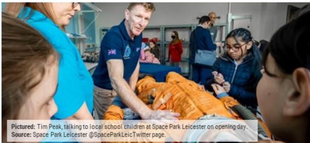
Pictured: Tim Peake, talking to local school children at Space Park Leicester on opening day.

joined in with a celebration of Mars Day. Tim said, "Every successful space mission calls for experts from a wide range of backgrounds to pull together and collaborate to answer bigger questions: and that's exactly what somewhere like Space Park Leicester helps to provide. I'm also excited to see this project highlighting the exciting careers available within the space sector and helping to train, educate and inspire our future generations."