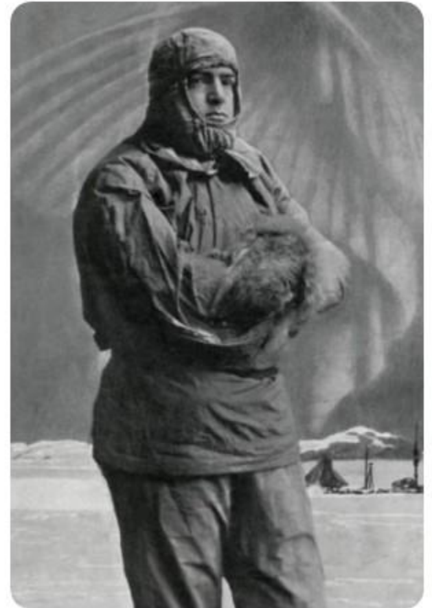
Pictured: Sir Ernest Henry Shackleton, who led three British expeditions to Antarctica.

Shackleton died on his fourth expedition to the Antarctic on 5 th January 1922.