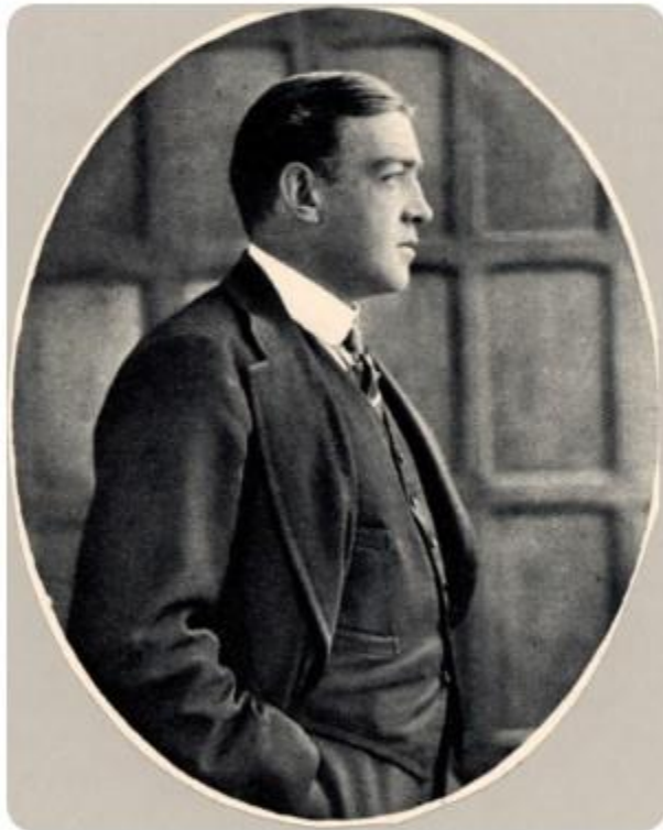
Pictured: Portrait of Sir Ernest Henry Shackleton

Ernest Henry Shackleton was born on 15 th February 1874 in Ireland. His father was a doctor and wanted his son to be one too, but Shackleton decided to join the merchant navy at the age of 16 instead. He was a keen explorer and was very interested in the North and South poles.