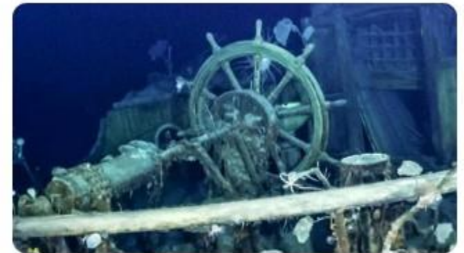
Pictured above: A photo of the discovered ship's wheel, found in the well deck.

On March 9 th , 2022, a team of scientists and adventurers announced they had finally located what remained of Endurance at the bottom of Antarctica's Weddell Sea. The team made the discovery using underwater robots, drones and by taking photos of the long-lost wooden ship where it had lodged in the seabed nearly 10,000 feet (over 3,000 metres) deep in clear and icy waters.