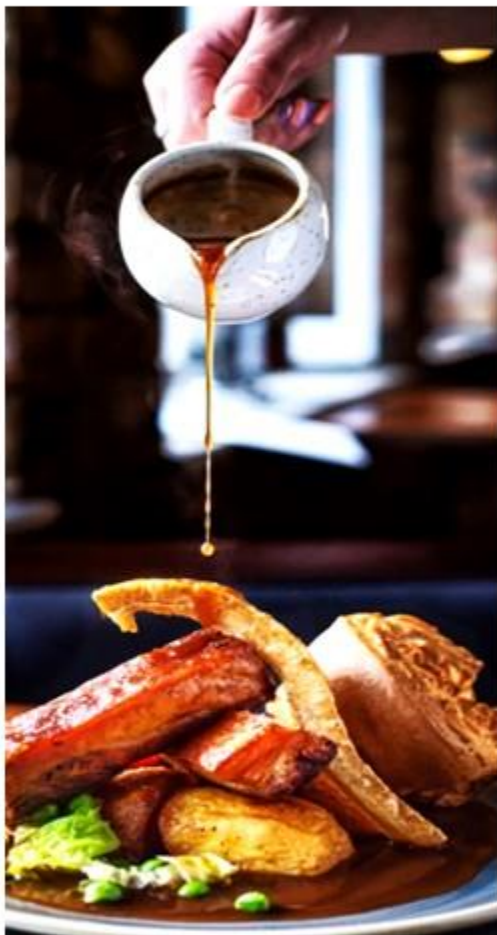
Pictured: Sunday roast dinner.