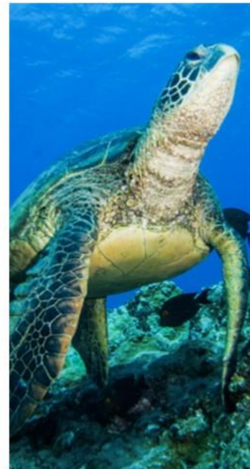
Pictured: A green sea turtle.

A breeding ground for green sea turtles has reported a 500 percent boom in the number of eggs laid since hunting them was banned. Scientists at Aldabra Atoll, one of Seychelles' most distant islands (it is over 1,000km southwest of the main island of Mahé), say this is a great conservation success story. An atoll is a coral island consisting of a reef surrounding a lagoon, generally over a former oceanic volcano. The endangered reptiles are one of the world's largest species of turtle, weighing up to 130kg and measuring up to 1.2m. They are great swimmers, who eat marine plants such as seaweed and sea grass, and they can live for up to 80 years! Professor Brendan Godley, from Exeter University, who helped to analyse the figures provided by researchers from the Seychelles Islands Foundation said, "The ongoing population increase of Aldabra's green turtles is testament to long-term protection and offers some clear evidence of the fact that we can be optimistic about marine conservation, well enacted."