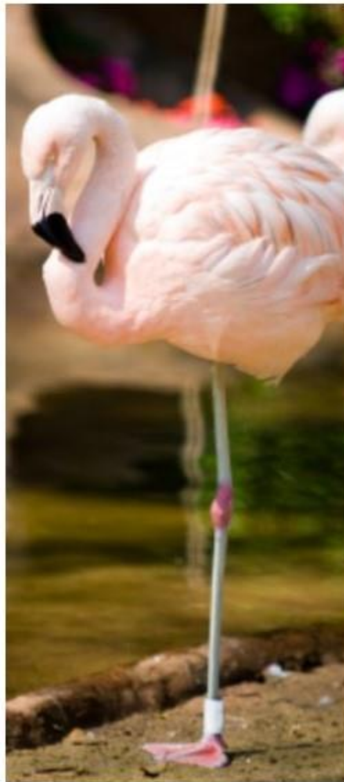
Pictured: A Flamingo

Did you know, flamingos prefer to stand on one leg and experts can't say for certain why they do that?