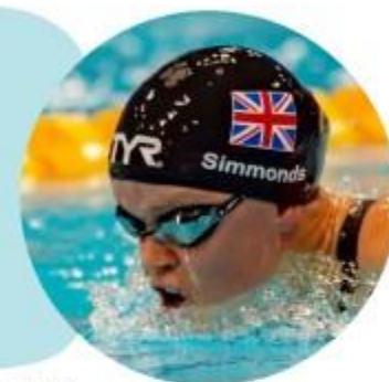
Paralympian swimmer, Ellie Simmonds.

"I want people to see that, yes, society is different and that's amazing. Let's embrace that. Don't treat anyone differently - we're all human beings."