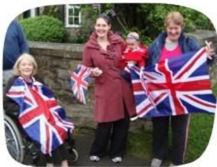
Ready for the Royal parade.

This year, 2022, the Queen has become the first ever British monarch to celebrate a Platinum Jubilee after 70 years of service. A nationwide extended Bank Holiday celebration begins on Thursday 2 nd June.