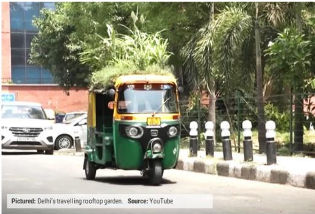
Pictured: Delhi's travelling rooftop garden.