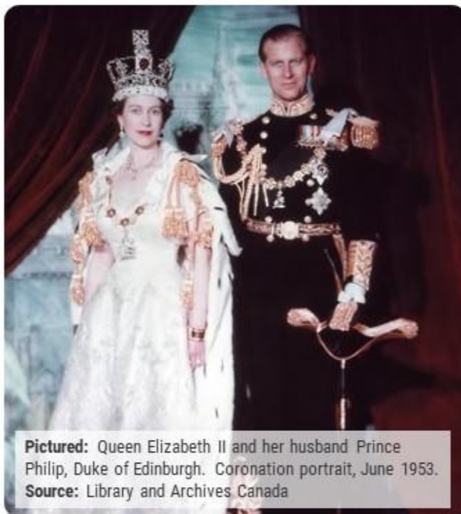
Pictured: Queen Elizabeth II and her husband Prince Philip, Duke of Edinburgh. Coronation portrait, June 1953.

Above: The different materials used to celebrate the length of the monarch's reign.