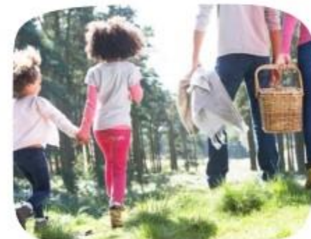
Heading for a family picnic

"We're having our own party at home to celebrate the Queen's Jubilee. We have invited some friends and we are going to have food, play games and everything will have a Union Jack theme!"