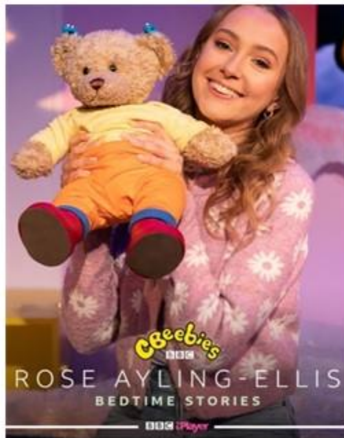
Pictured: Rose Ayling-Ellis and bear