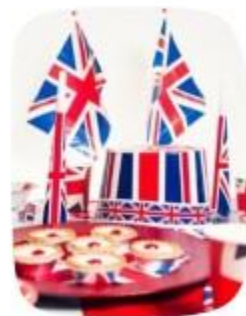
Union Jack party decorations

"There is a castle near where I live and they are having a free family event. You take a picnic and there are stalls, rides, music and entertainment. You can also buy tea, coffee and cake."