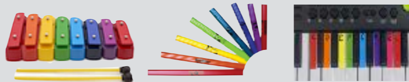
Chime Bars Boomwhackers Keyboards