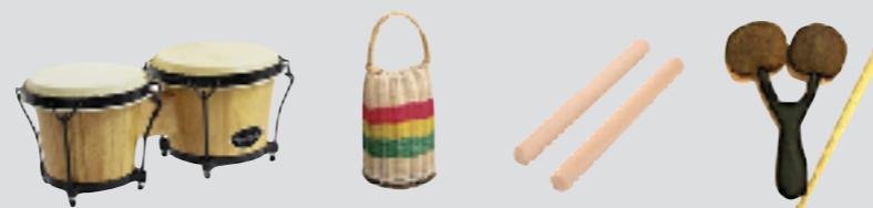
Bongos Shaker Claves Agogo