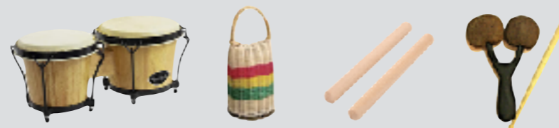
Bongos Shaker Claves Agogo