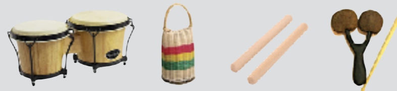
Bongos Shaker Claves Agogo