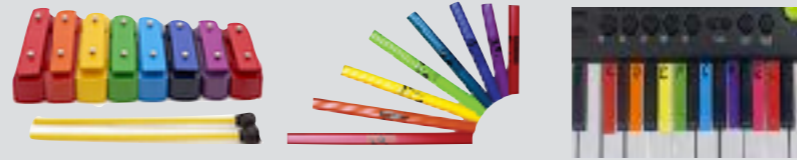
Chime Bars Boomwhackers Keyboards