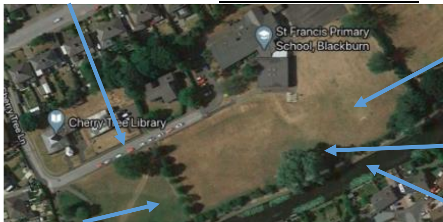
An aerial view of our school