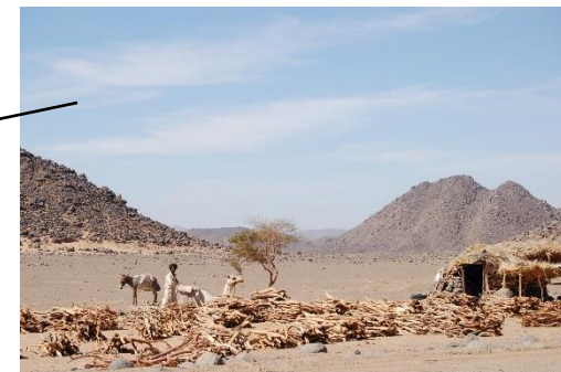
The Sahara Desert is hot.