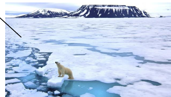
The Arctic is cold.