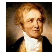
Sir Robert Peel