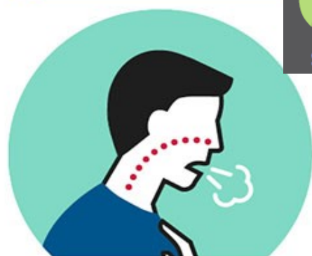
New shortness of breath