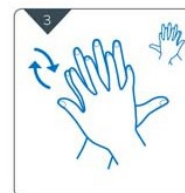
Fingers interlaced, rub hands together, then right palm to back of left hand and vice versa