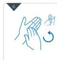
Rotational rubbing in both directions by placing fingertips of each hand in opposing palm