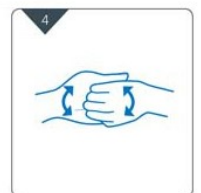
Cusp back of fingers into opposing palm and rub side to side