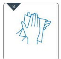
Dry hands thoroughly and sanitise