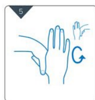
Clasp each hand around opposing thumb and rub in rotational manner