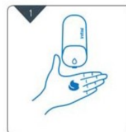
Wet hands and apply soap

We're all in this together so thank you for helping our school community (staff, children, parents and wider community) to stay as safe as possible.