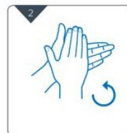
Rub hands, palm to palm