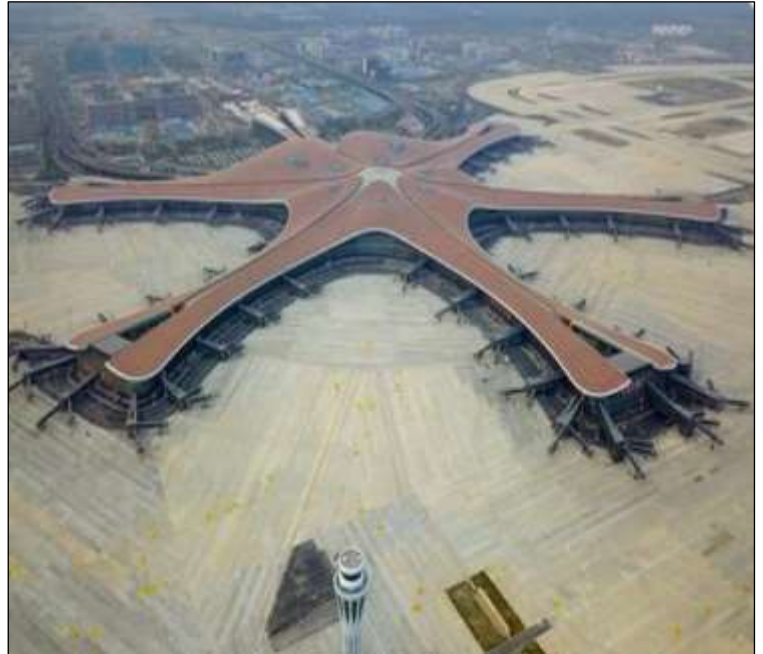
Pictured: Beijing Daxing Airport, the six spokes coming out from the middle of the building, earned it the nickname "The Starfish", taken from their Twitter page.

In China, Beijing's new Daxing Airport, the most expensive airport in history, costing around £13 billion to build, is housed in the world's biggest single-terminal building and spans one million square metres! The airport, which was constructed south of Beijing in just five years, has lots of built-in hi-tech features. These include ultra-fast internet, advanced facial recognition and smart robotics. It has a star-shaped layout and it is the first airport to have two-storey departure gates and has been designed to handle up to 72 million passengers a year! It's not just an airport, it will contain shops, restaurants and entertainment, as well as interactive pet hotels and childcare facilities!