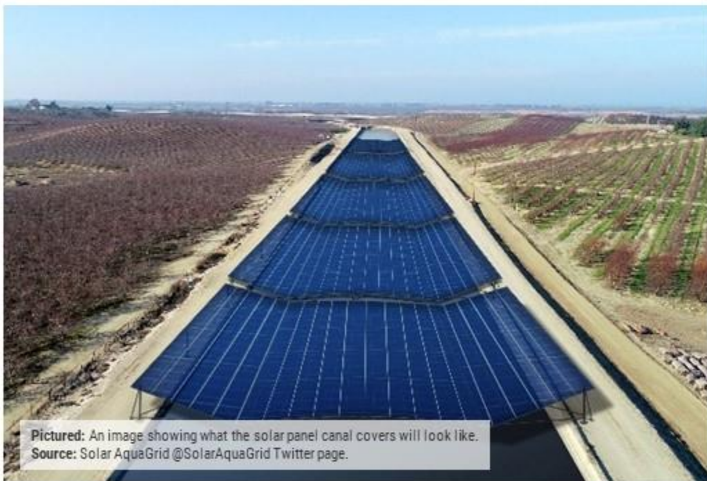
Pictured: An image showing what the solar panel canal covers will look like.

otherwise evaporated water, while powering millions of homes! This is a first for the US, but similar projects are already running in India. The state has 6,400 kilometres of canals. Experts estimate that if all of the Golden State's canals were covered with solar panels, they could produce 13 gigawatts of renewable power. One gigawatt is enough to power 750,000 homes, so that would be enough power for 9.75 million households.