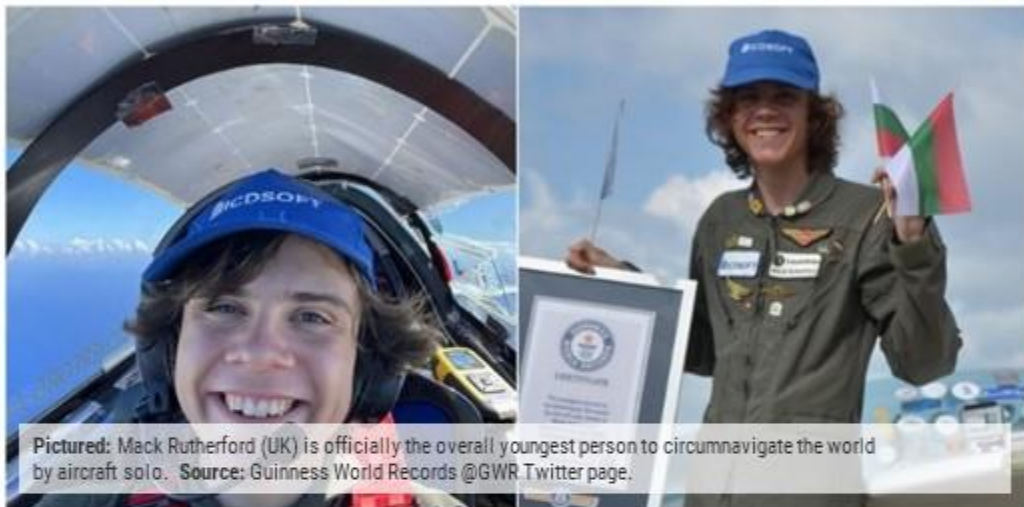
Pictured: Mack Rutherford (UK) is officially the overall youngest person to circumnavigate the world by aircraft solo.