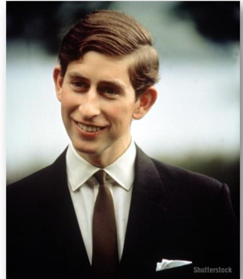
Pictured above: Prince Charles on his Tour of Wales in July, 1969

King Charles III, 2013, in a Time magazine interview.