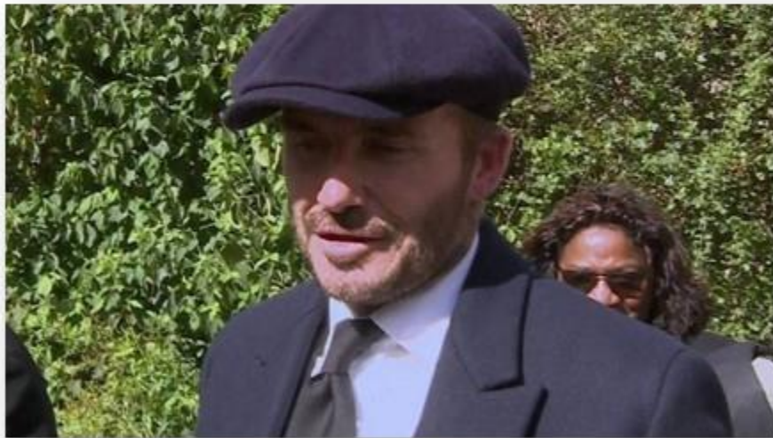
Former footballer, David Beckham, who queued for around 12 hours.

Thousands of people joined a queue, which at times reached around 5 miles long, to pay their respects to the Queen, whose coffin was at Westminster Hall. Ambulance teams had to treat members of the public along the route of the queue. The majority of incidents were people fainting from having to stand for so long. The route was lined with Portaloos so queuers were able to use the toilet whilst waiting.