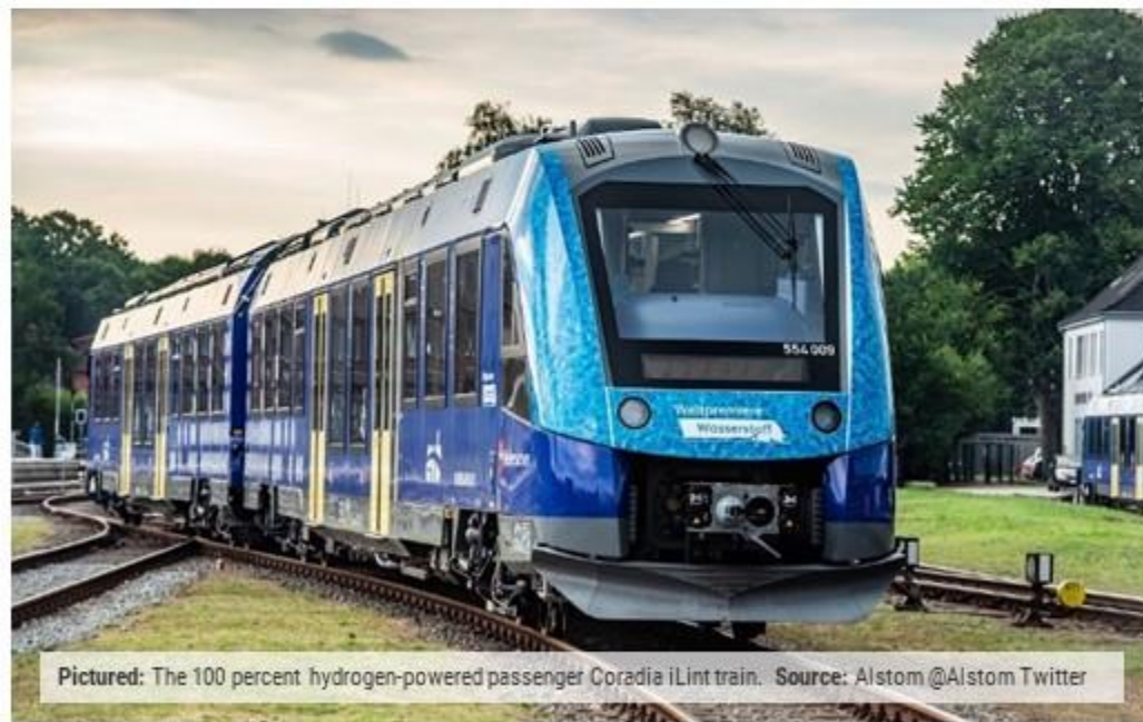
Pictured: The 100 percent hydrogen-powered passenger Coradia iLint train.