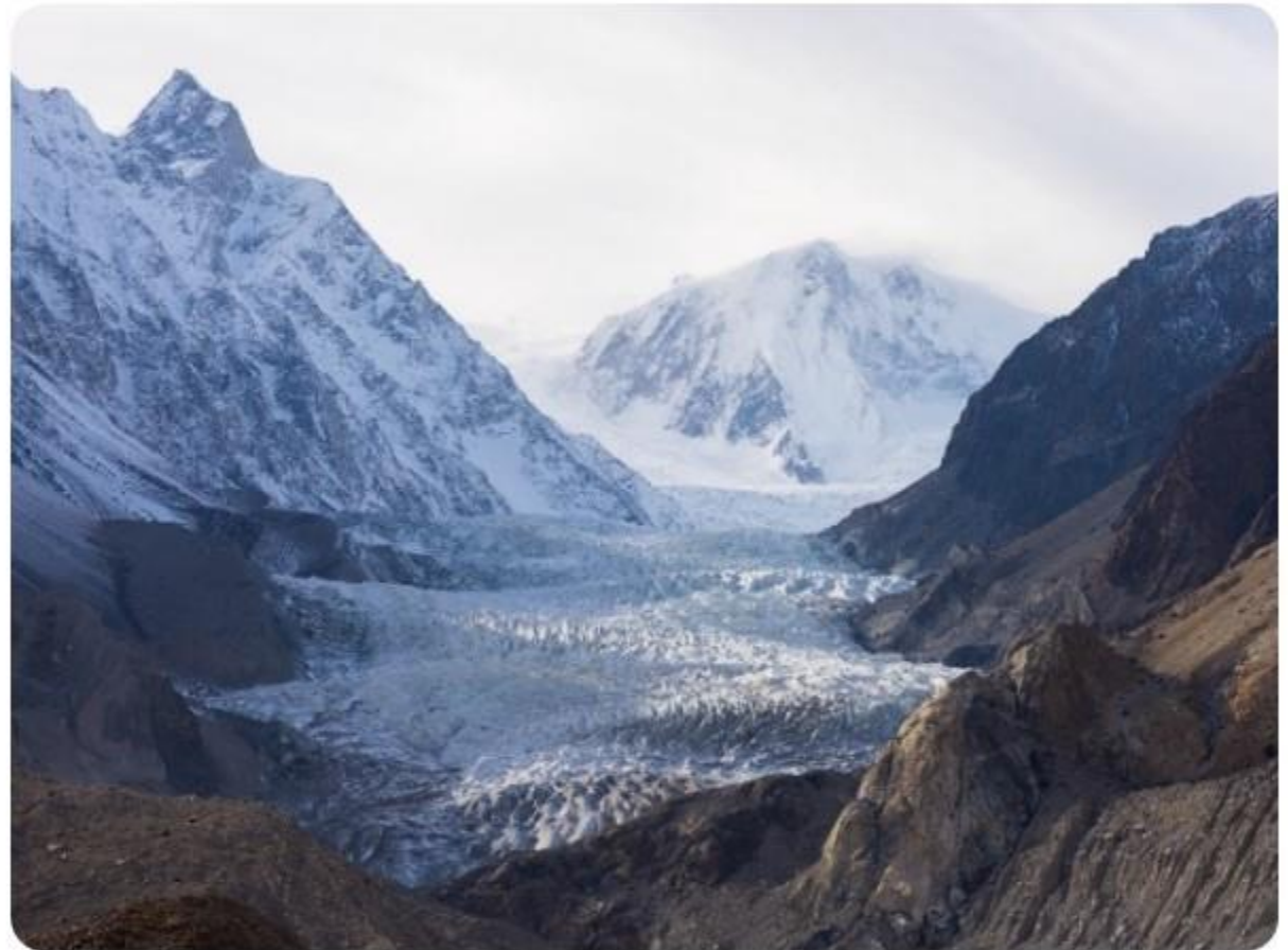
Pictured above: One of the largest glaciers in Pakistan

Some scientists believe the large amount of rainfall is caused by a warmer atmosphere holding more water, therefore producing heavier downpours.