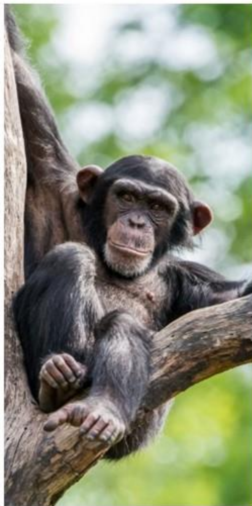
Pictured: A Chimpanzee.