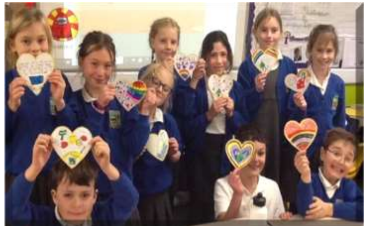
Pictured above: Children from Settle CE Primary School