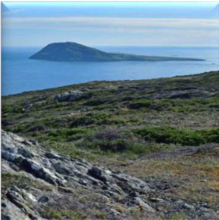
Pictured: Bardsey Island in the distance as seen from mainland Wales