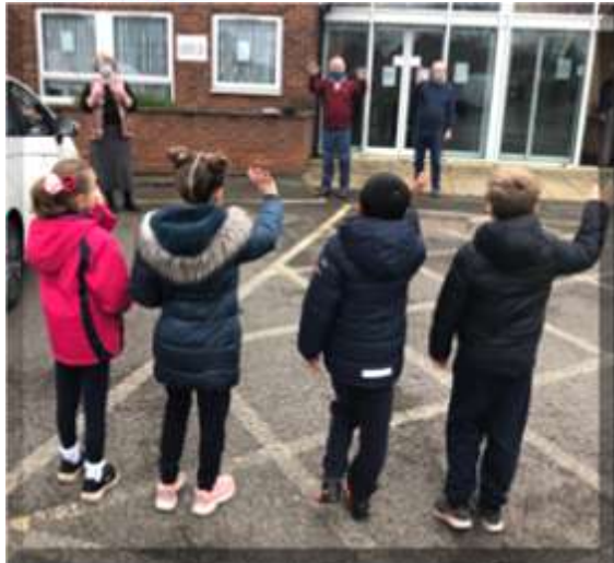
Pictured: St John the Baptist, Normanton