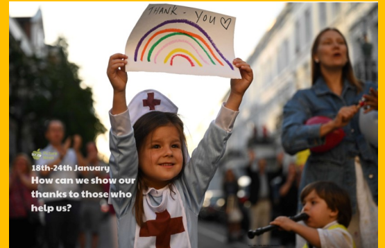
18th-24th January How can we show our thanks to those who help us?