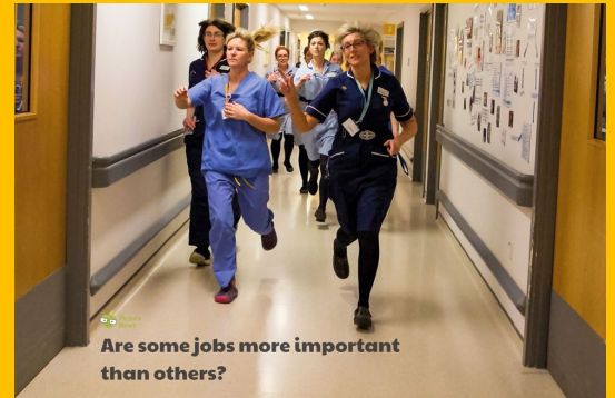
Are some jobs more important than others?